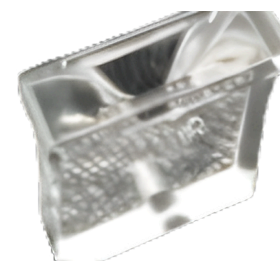
Half Cube (mm) 22 x 13 x 22