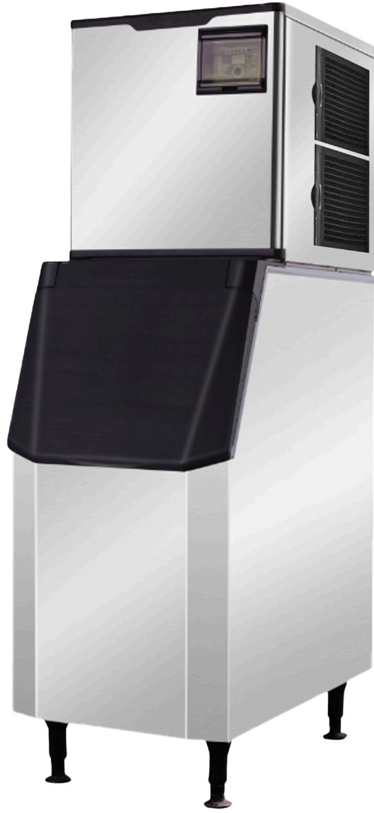
Image shown with B-305 Ice Bin