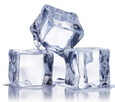
Full Cube (mm) 22 x 22 x 22