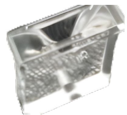
Half Cube (mm) 22 x 13 x 22