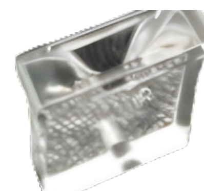
Half Cube (mm) 22 x 13 x 22