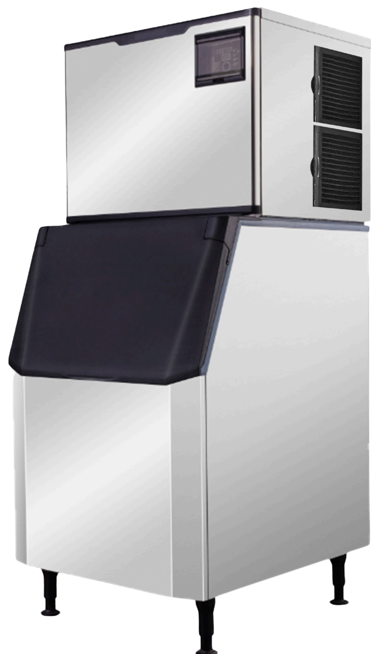
Image Shown with B-445 Ice Bin