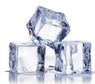
Full Cube (mm) 22 x 22 x 22