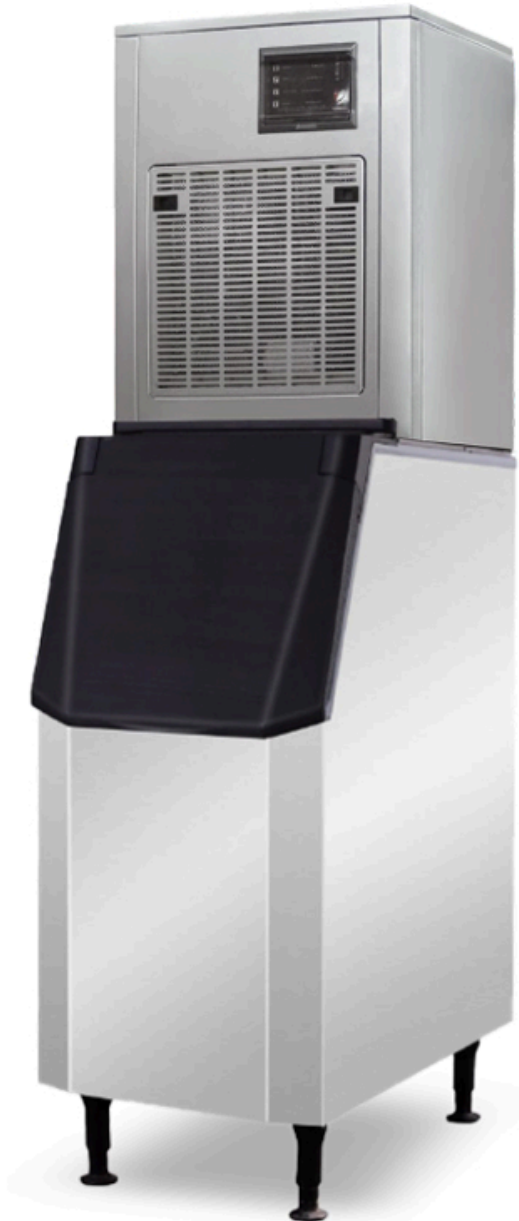
Image shown with B-305 Ice Bin