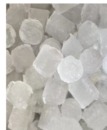
Pearl Ice (mm) 11 x 11 x 15