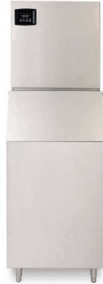
NIB310 Shown with NI360F Ice Machine, Sold Separately

NIB310 COMMERCIAL ICE STORAGE BIN, 310LB, 22 IN WIDE