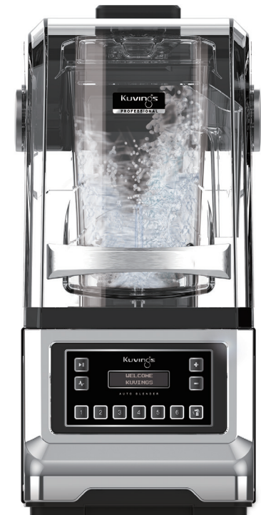
AUTO BLENDER CB980