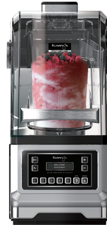
AUTO VACUUM BLENDER CB1000