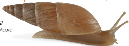
Door Snail Alinda biplicata

Glass Snails and Garlic Snails - Another group of tiny little flattened snails that can be found in the garden. Telling them all apart can be a bit tricky without a detailed field guide but the black body and shiny glossy shell of the Glass Snail is fairly easy to spot. It gives off a faint whiff of garlic when disturbed but not as stinky as the Garlic Snail which looks similar!