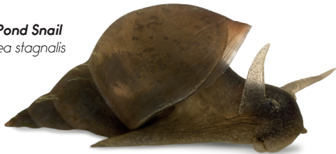
Great Pond Snail Lymnaea stagnalis

Great Ramshorn Snail - This is a well named beauty of a Pond Snail easily recognised by its large (over 3cm) rounded button-like coiled shell which is flattened from side to side. Sometimes you get populations which are missing some of the dark colours in the body and so it appears a blood red, literally as it happens as the red is haemoglobin pigments in the blood (the same as you and me).