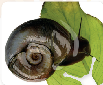
Great Ramshorn Snail Planorbis corneus

Great Ramshorn Snail - This is a well named beauty of a Pond Snail easily recognised by its large (over 3cm) rounded button-like coiled shell which is flattened from side to side. Sometimes you get populations which are missing some of the dark colours in the body and so it appears a blood red, literally as it happens as the red is haemoglobin pigments in the blood (the same as you and me).