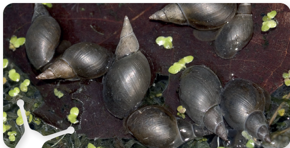
Great Pond Snails Lymnaea stagnalis

If you are keeping some Pond Snails, try and keep them on your bedside table and at night you will hear a gentle popping noise as they open their pneumostome to breathe at the surface. The warmer the water the more popping you'll hear as warm water doesn't hold much dissolved oxygen and so they can't breathe through their skin and need to come to the surface.