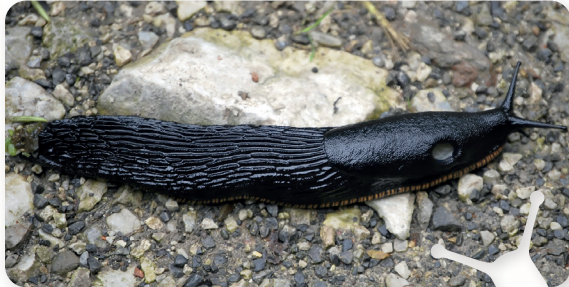
Great Black Slug Arion ater

Great Black Slug - This is the second biggest slug in the UK and it comes in two major colour forms - the black one and the brown one. Both are recognizable as they all have a pretty little foot fringe of orange with little black bands.