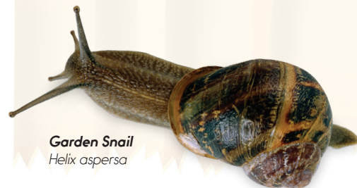
Garden Snail Helix aspersa

Banded Snails - There are two different kinds - the White-Lipped and the Brown-Lipped Banded Snail. I'm rather fond of these pretty little snails. They don't get very big, about 1.5cm - 2cm across the shell. The Dark-Lipped is often found in gardens while the White-Lipped likes it a little wetter. You can tell the two apart by the colour of the lip in the adults. However, there is much confusion as they come in a variety of different colours (from yellow to pink!) and some have no bands on at all!