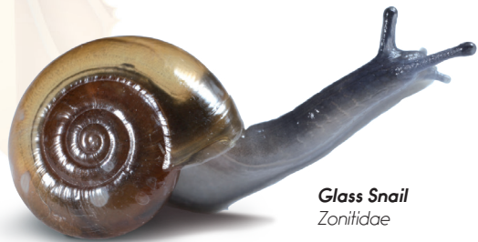
Glass Snail Zonitidae

Door Snails - These are a group of very pretty snails with spindle shaped shells. They like it a little drier than some other species and can close their shells with a little plate, hence the name. If you decide to keep these put moss and leaf litter into your visualarium as this is what they like to eat.