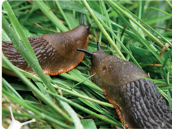
Garden Slugs Arion hortensis

The Garden Slug - This is another round backed slug. It is quite small - at full stretch it is only around 3-4cm long with reddish brown tentacles and a yellow/orange foot and fringe.