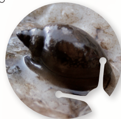
Wandering Snail Lymnaea peregra

(See the Question and Answer section for information on keeping Aquatic Snails)