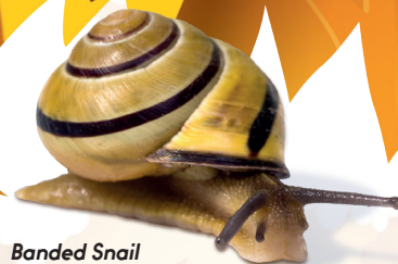
Banded Snail Cepaea hortensis

Garden Snail - This is the commonest of the British snails and can be found in almost any garden. They are easily recognised and spotted as they are quite big (they have a shell around 3cm across) and have a distinctive mottled shell with lots of lovely streaks of light and dark brown. Not to be mistaken for the fully protected and bigger Roman Snail which has a lighter, much more uniform colour to its shell.