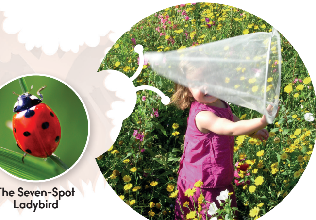
The Seven-Spot Ladybird