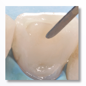
APPLY ELASTICALLY LM-Arte™ Applica

A very thin, flexible spatula designed for transporting and esthetic modeling of the composite. The flexible working end gently and precisely sculpts composite layers to imitate the natural shape of the tooth. The thin tip of the Applica enables modeling in narrow spaces or against the matrix band. Instrument is available with non-stick LM Dark Diamond<sup>TM</sup> coating.