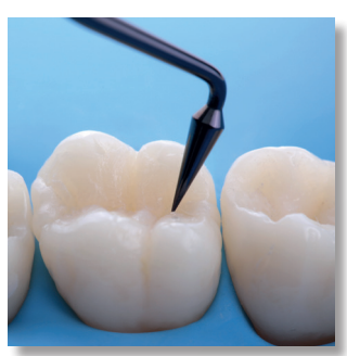
SCULP DELICATELY LM-Arte™ Fissura

A modeling instrument with extremely sharp pointed tips. The conical tip is perfect for sculpting the anatomy of the occlusal area of the posterior teeth with just one instrument. The fine, probe-shaped tip is optimal for modeling fissures and mamelons as well as for layering characterization composites and sealants. The flexibility of the Fissura enables gentle probing to ensure thereis no excess