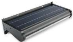
5W Solar Panel 5.5V 5W