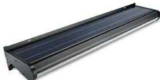
10W Solar Panel 5.5V 11W