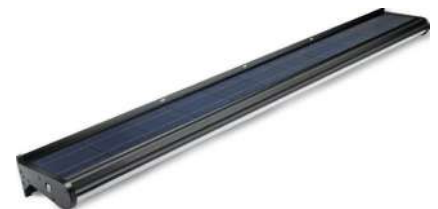
20W Solar Panel 5.5V 17W