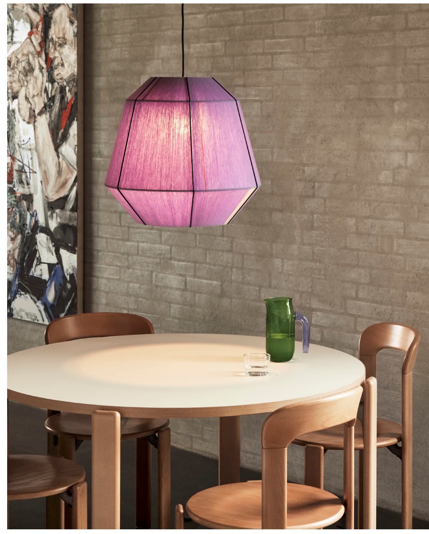
Bonbon Shade 500 | Lavender

Material Yarn, Powder coated steel Design Ana Kraš