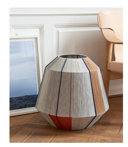
Bonbon Shade 500 | Earth tones

Material Yarn, Powder coated steel Design Ana Kraš