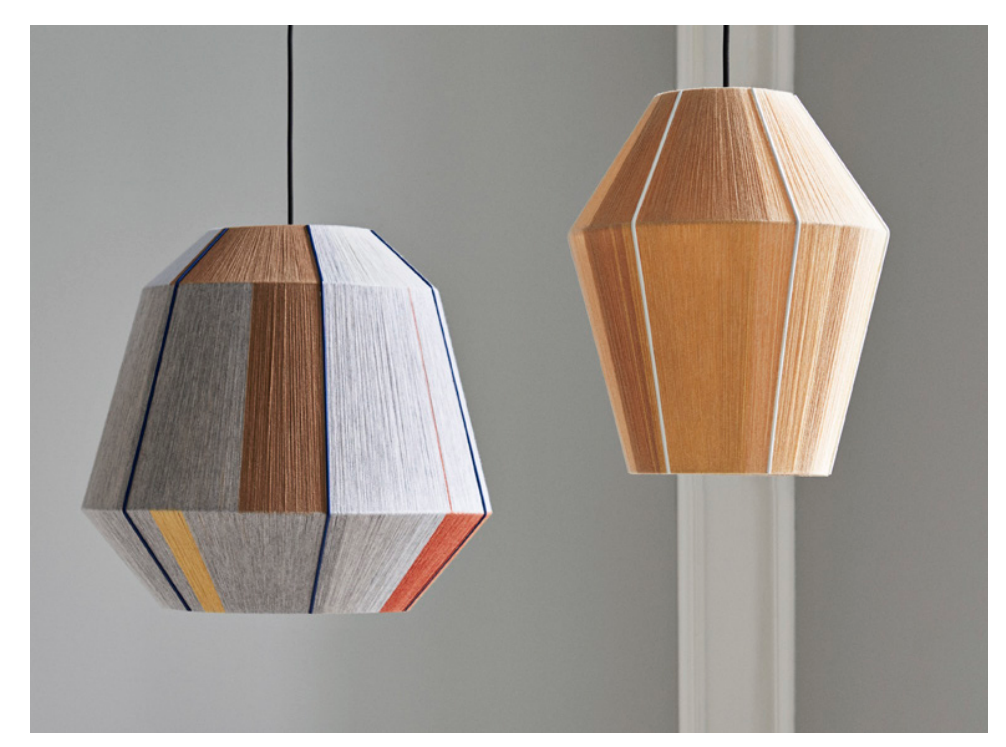
Bonbon Shade 500 | Earth tones Bonbon Shade 320 | Yellow melange