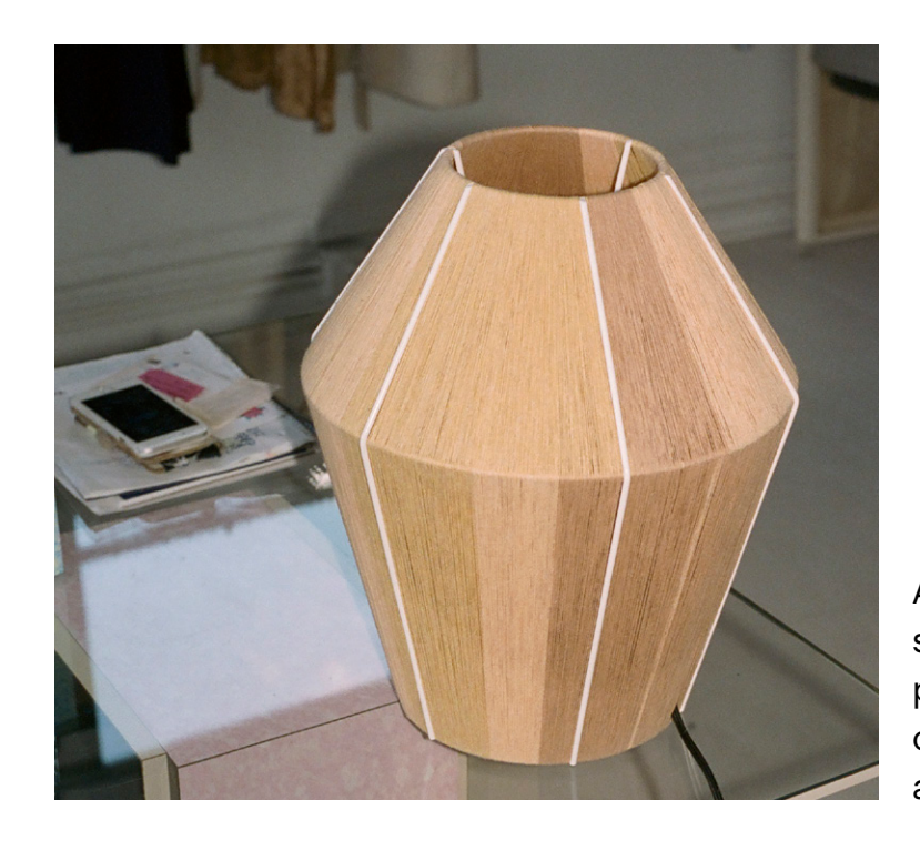
Ana Kraš uses carefully selected threads and palettes to create bold combinations of textures and colours.