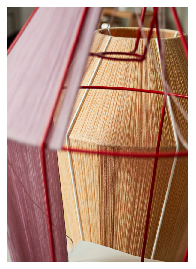
Bonbon is a unique design that combines the craftsmanship and originality of handmade artwork with the quality of a functional object.