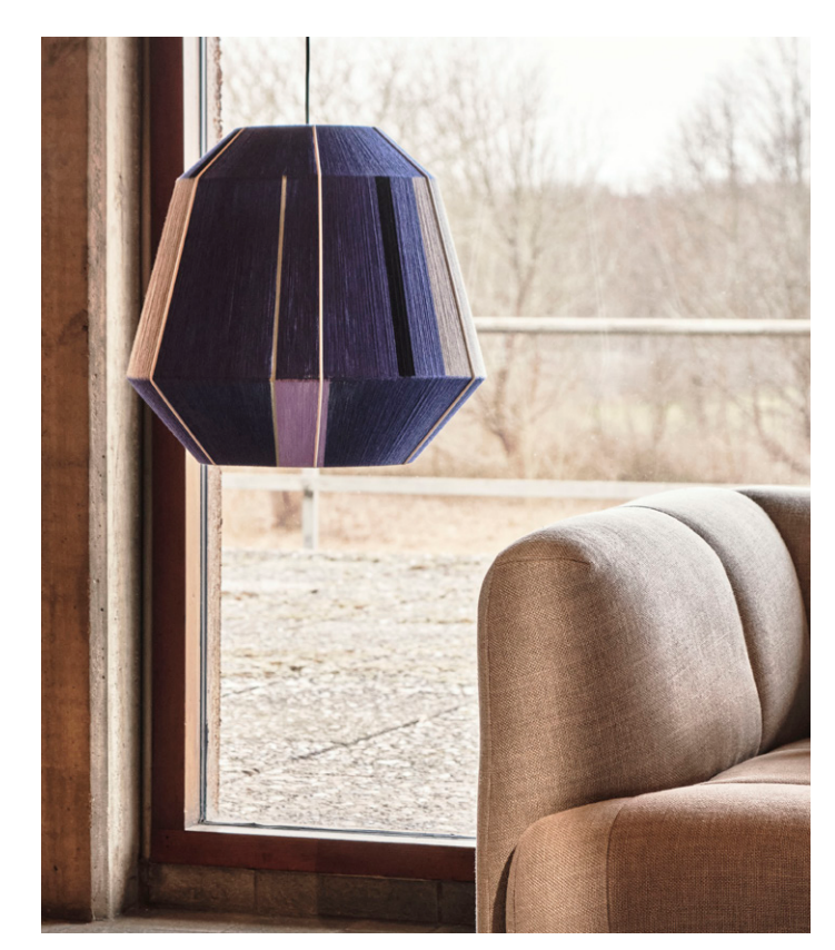
Bonbon Shade 500 | Blue tones