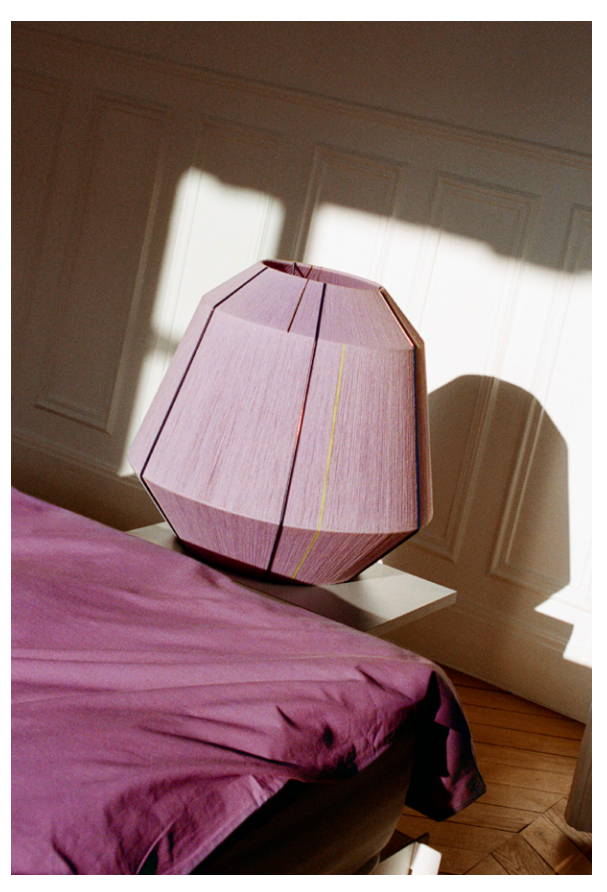
Bonbon Shade 500 | Lavender