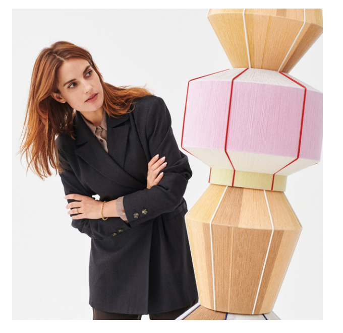
Ana created her first Bonbon Lamp as a student project back in 2009, and years later she designed different variants of Bonbon for HAY, using the same process and type of yarn.