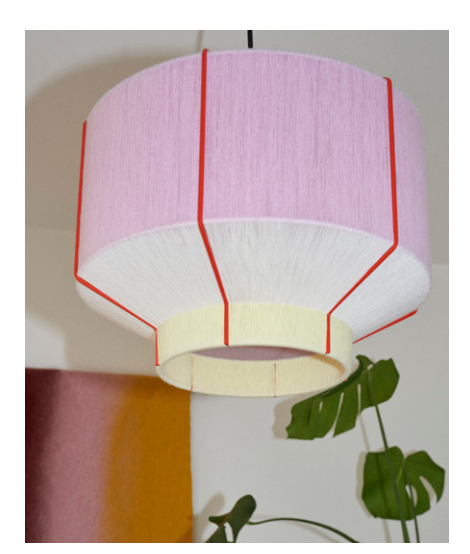
Bonbon Shade 380 | Ice cream