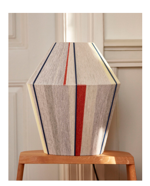
Bonbon Shade 320 | Grey melange