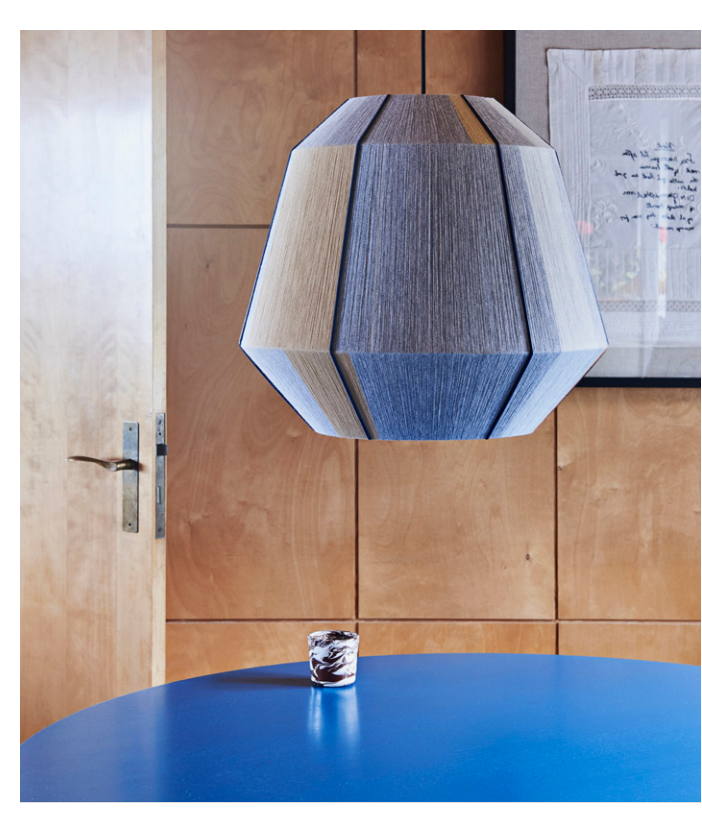
Bonbon Shade 500 | Earth tones