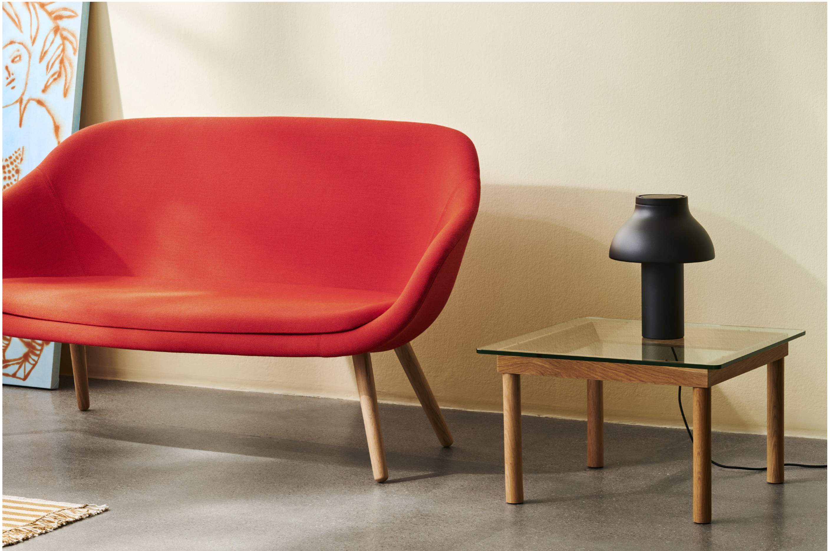
PC Table Lamp | Soft black