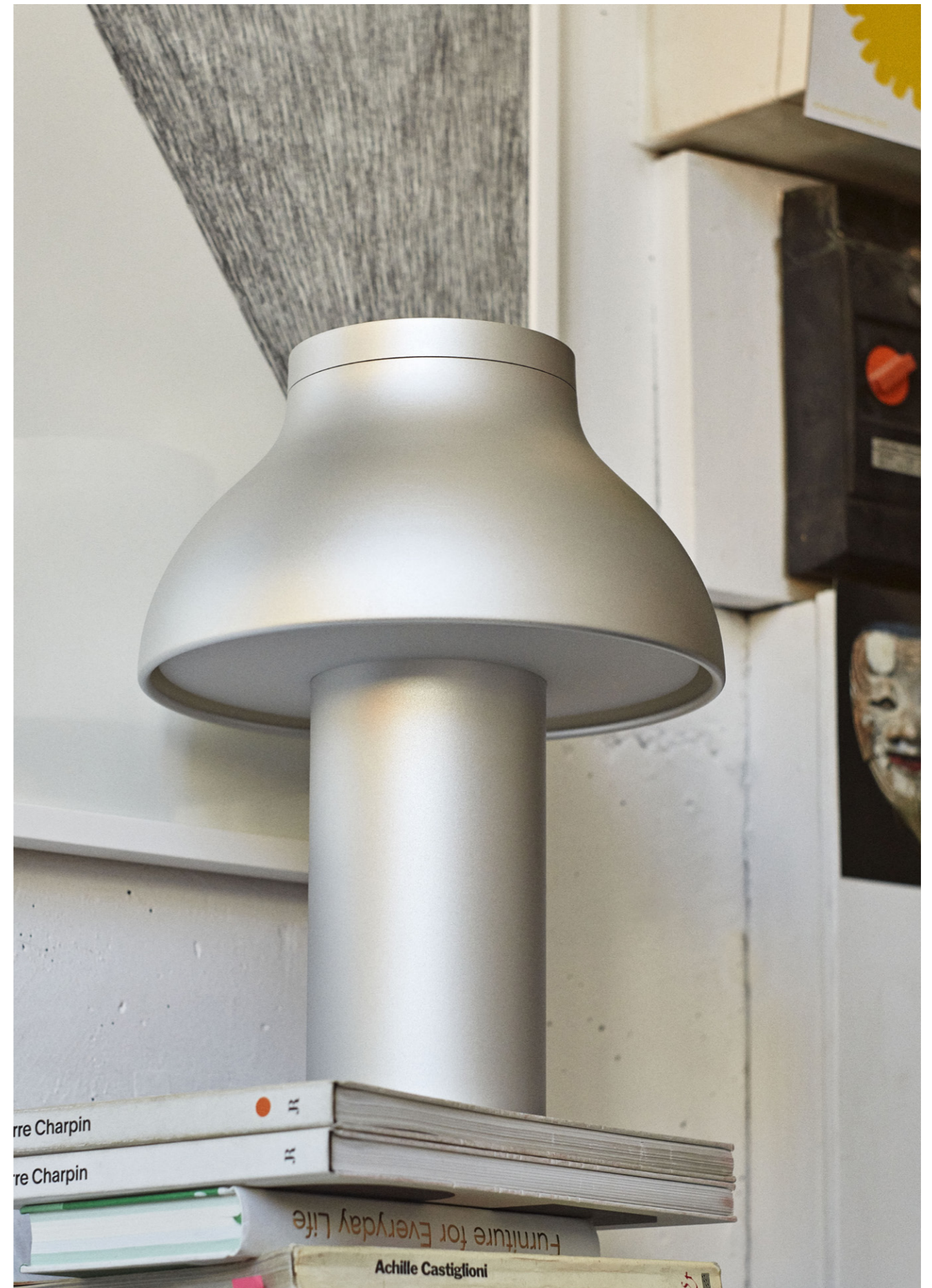
PC Table Lamp | Aluminium anodised