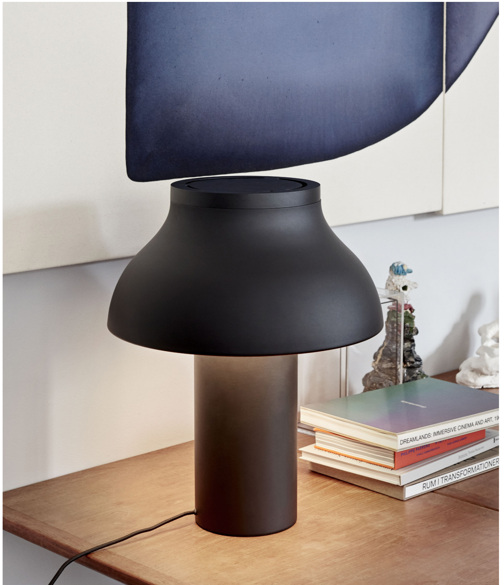
PC Table Lamp | Soft black