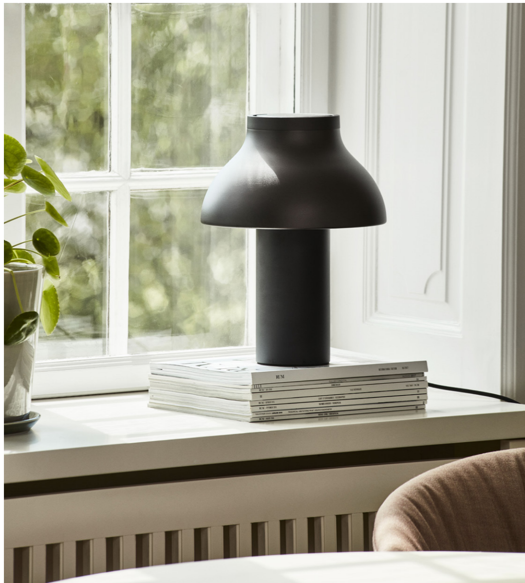
PC Table Lamp | Soft black