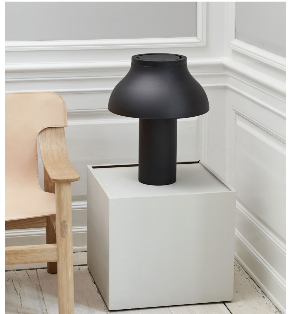
PC Table Lamp | Soft black