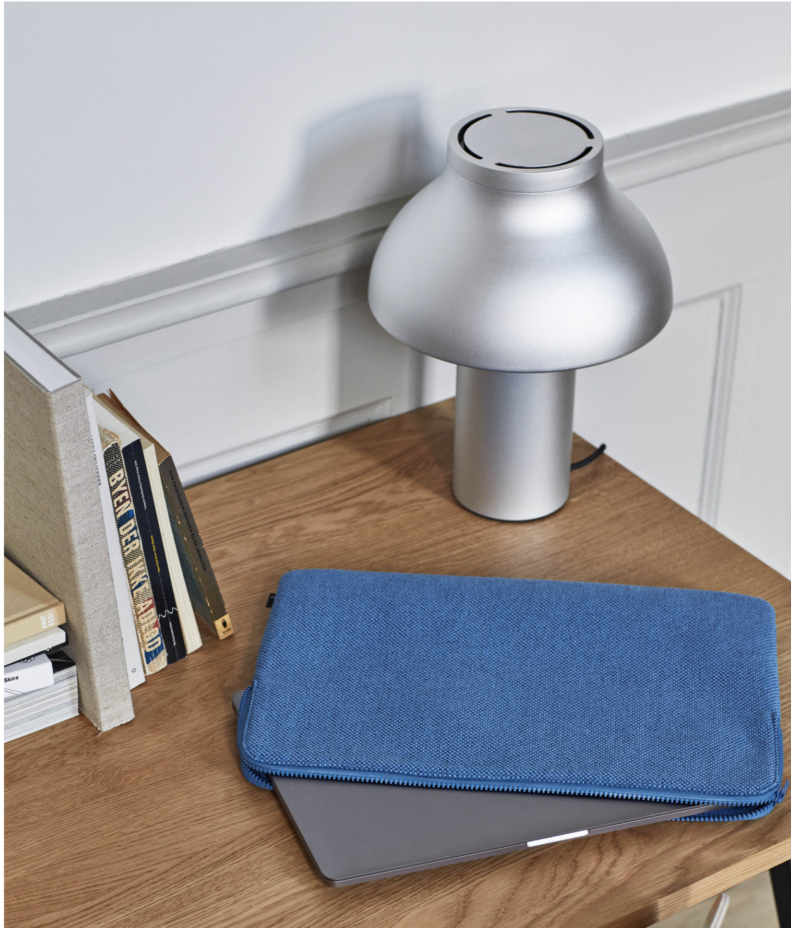
PC Table Lamp | Aluminium anodised