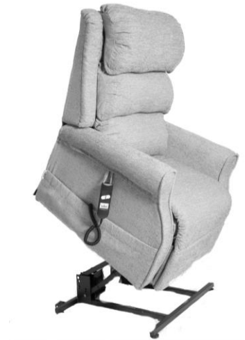
STANDING UP POSTION