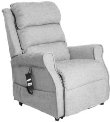
STANDARD SEATING POSTION

The chair has a range of electrically operated adjustments that can be operated using the control handset, specifically as shown below: