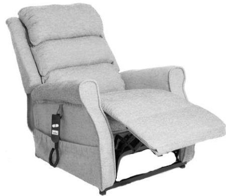
LEGREST ELEVATION POSTION