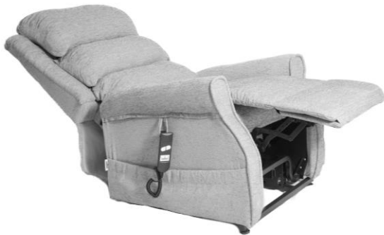
FULL RECLINE POSTION