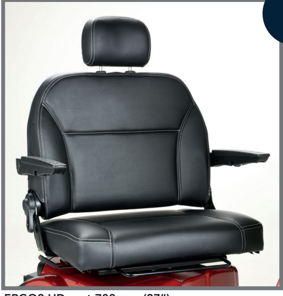
ERGO2 HD seat 700 mm (27")