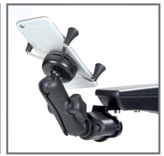
Mobile phone holder