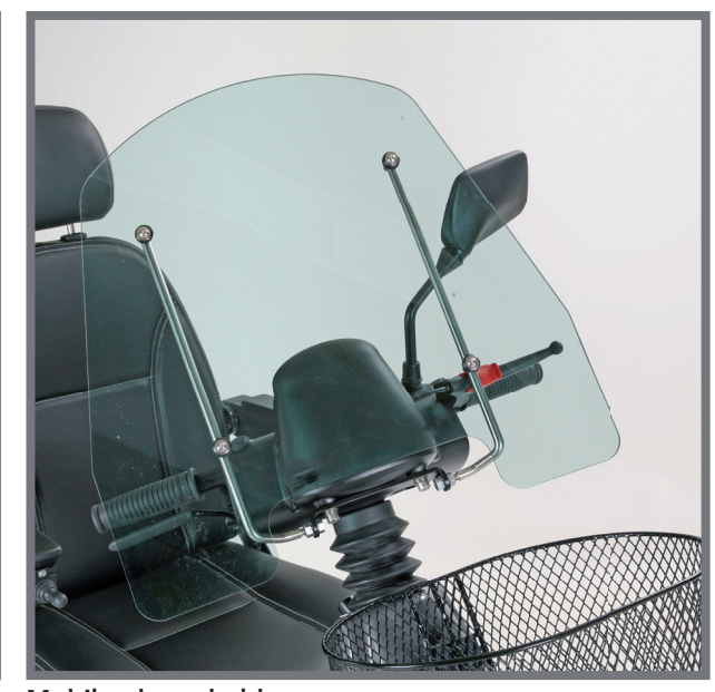
Mobile phone holder