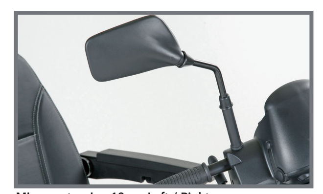
Mirror extension 10 cm Left / Right.