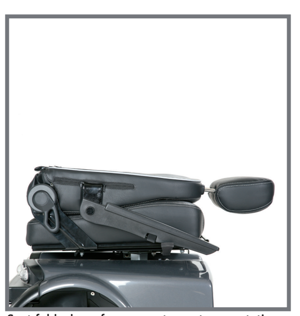
Seat folds down for compact easy transportation