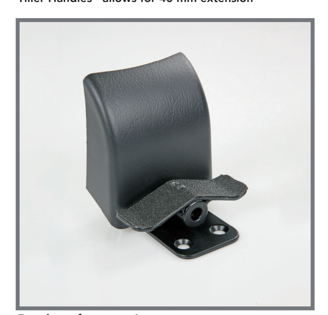
Foot lever for gas - wigwag