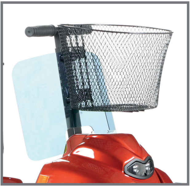
Adjustable handle with windscreen