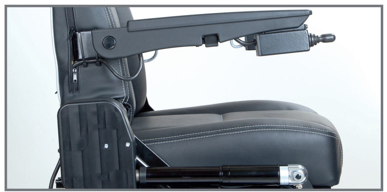
Electric seat tilt - max weight 27.7 st (175 kg)