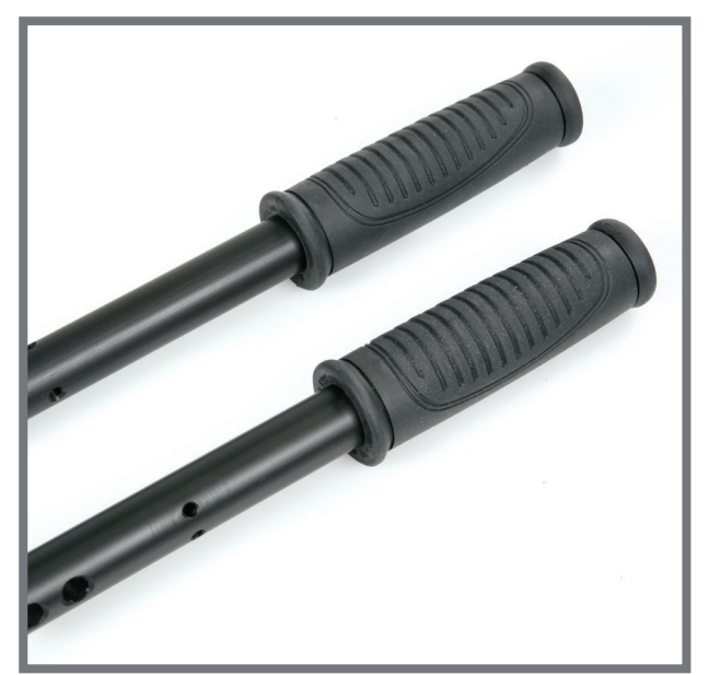
Tiller Handles - allows for 40 mm extension