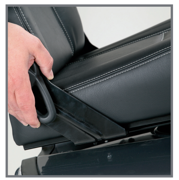
Adjusting the armrest angle