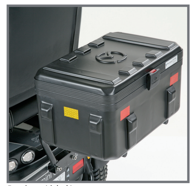
Rear box with locking system