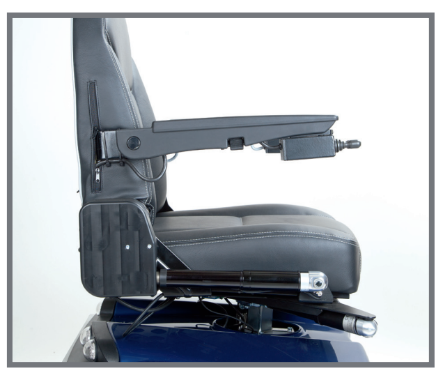
Electric swivelling - max weight 27.7 st (175 kg)