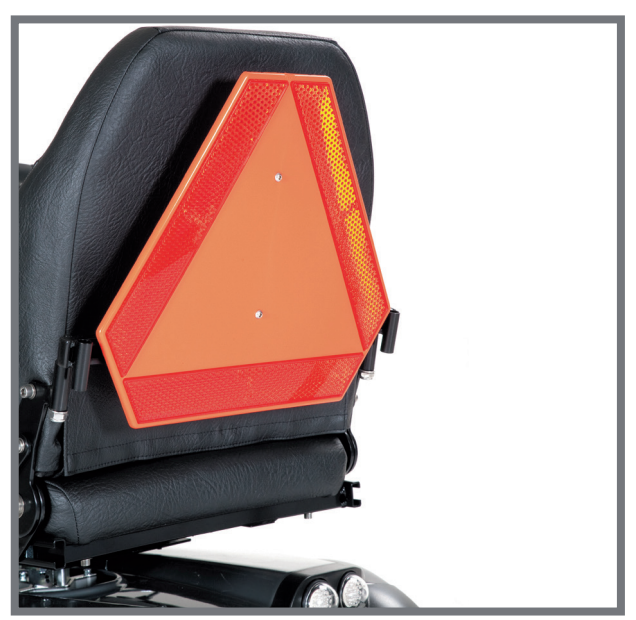
Warning triangle with bracket