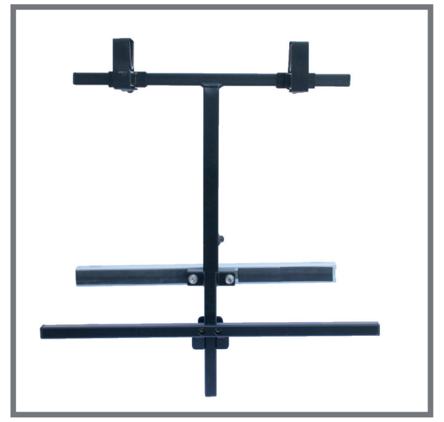
Walking frame carrier, max weight 20 kg (44 lb)