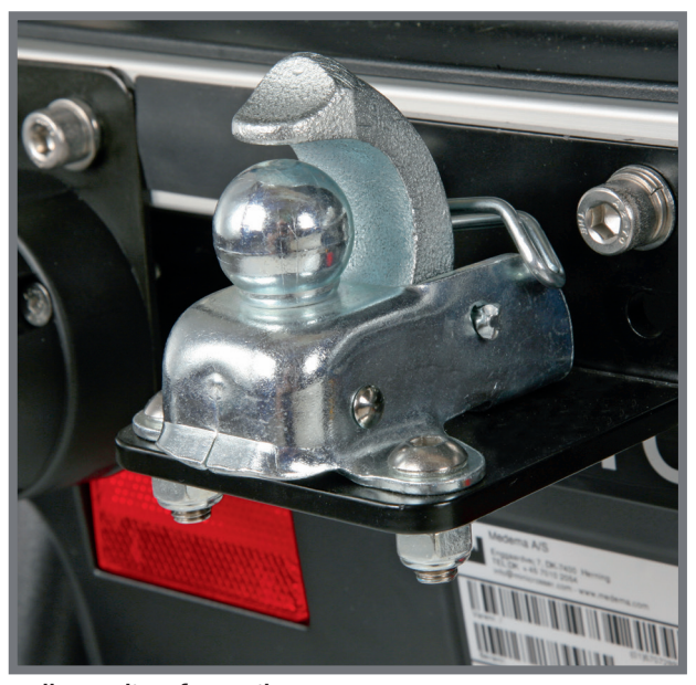
Ball coupling for trailer