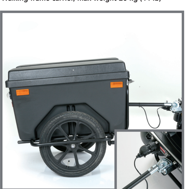
Trailer in black with lock and tow bar