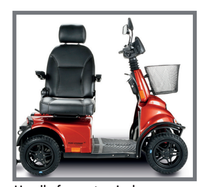
Handle for seat swivel