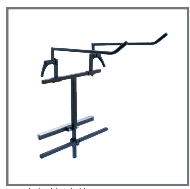
Manual wheelchair holder