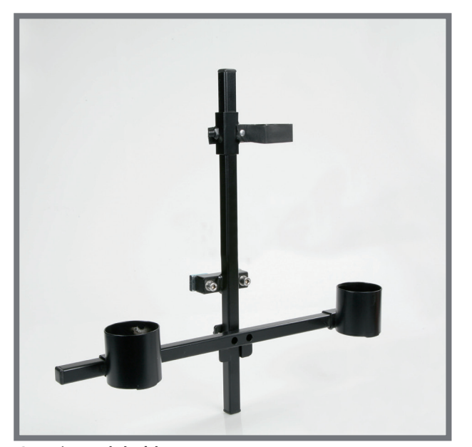
Cane/ crutch holder