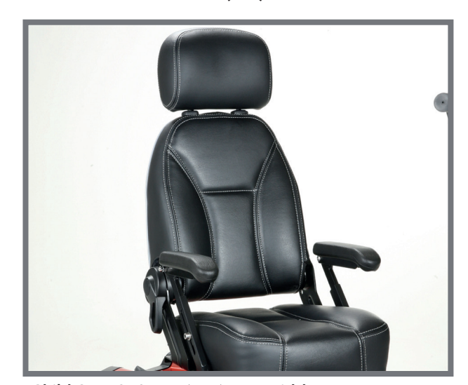
Child Seat 350 mm (14") seat width