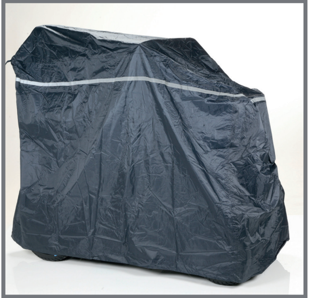
Weatherproof tarpaulin cover