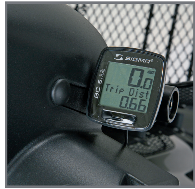
Speedometer for Mini Crosser X1