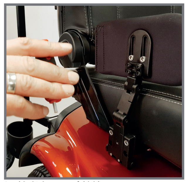
Stealth thigh support foldable