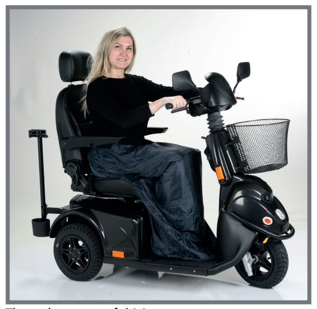
Thermal waterproof driving cape