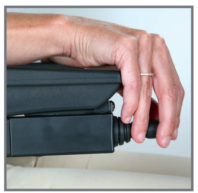
Electric operation - max weight 39 st (250 kg)