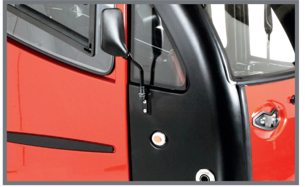
Mirror for Cabin