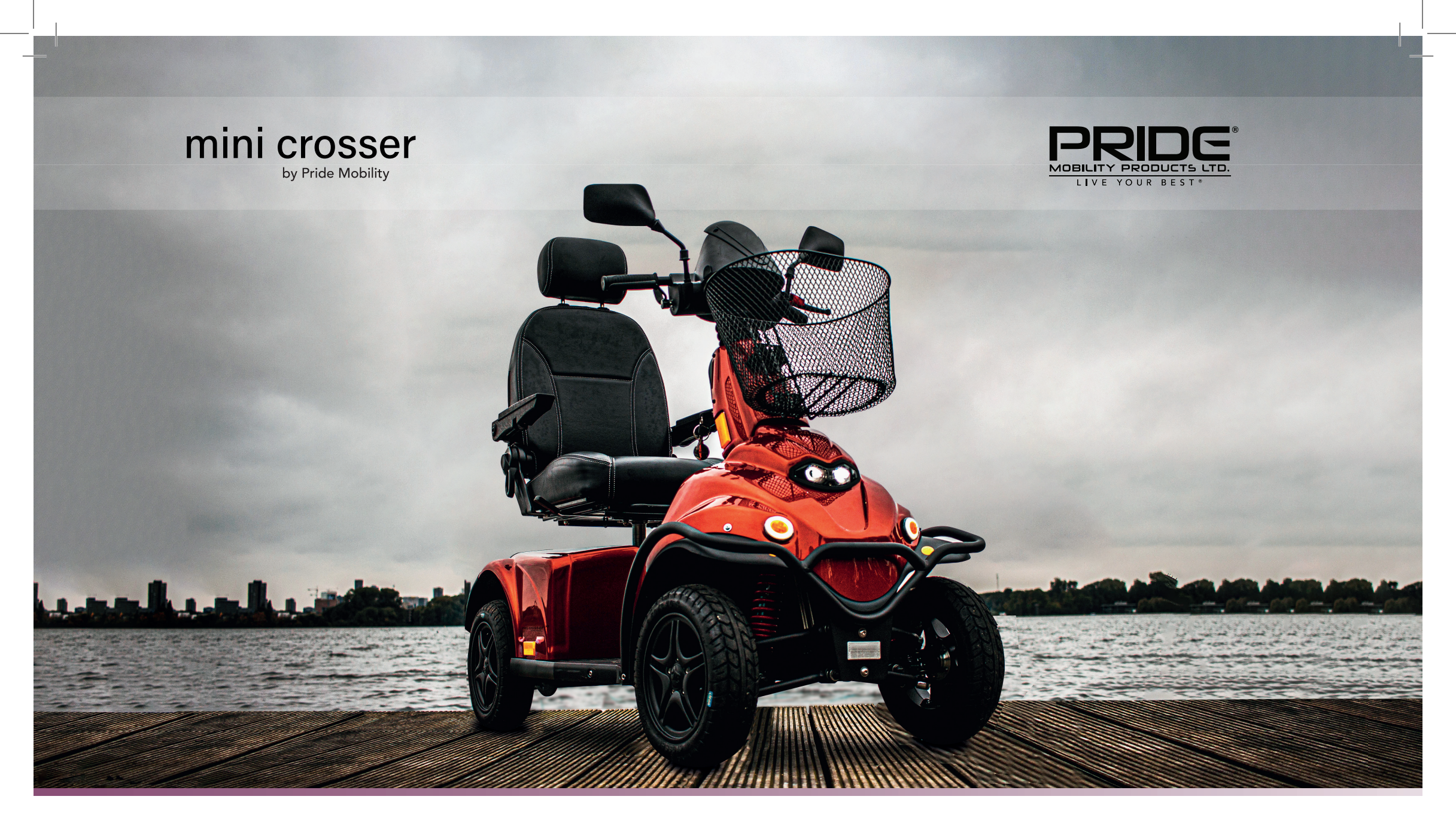
Mini Crosser X1 and X2 by Pride Mobility