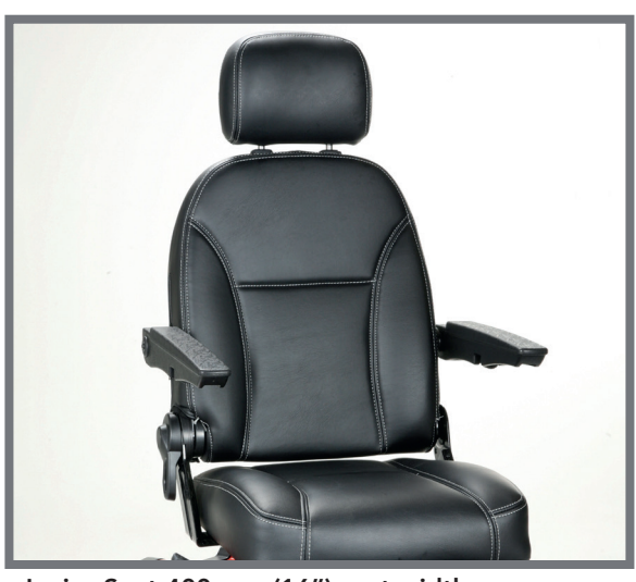
Junior Seat 400 mm (16") seat width