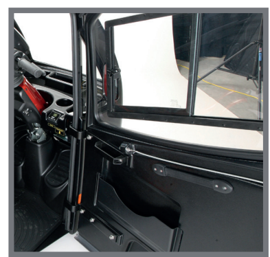
Easy to open door