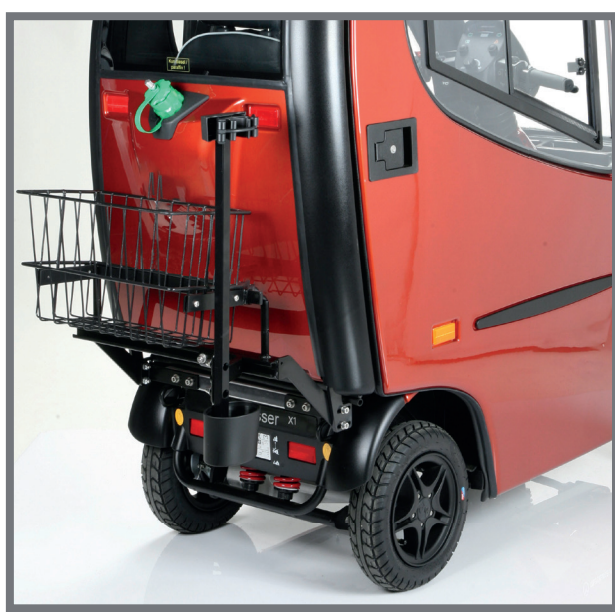
Accessory adaptor for cabin