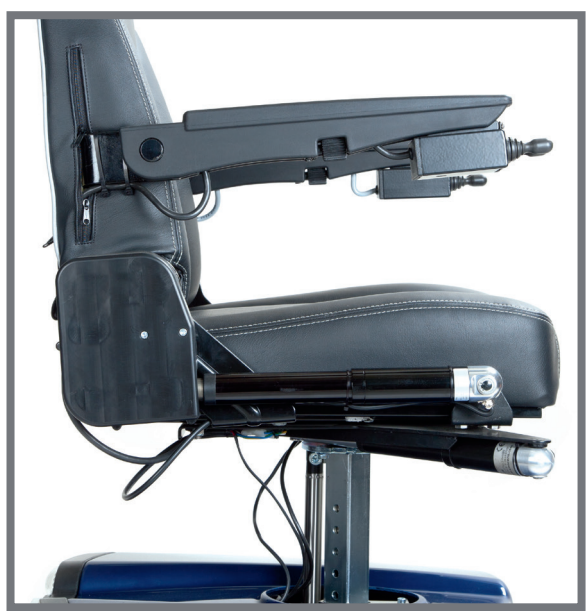
Electric seat lift - max weight 39 st (250 kg)