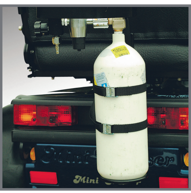
Oxygen tank holder