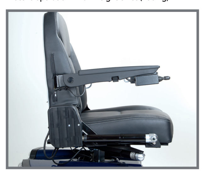
Electric forward/backward - max weight 27.7 st (175 kg)