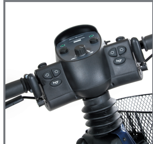
Left and right accelerator, with switch