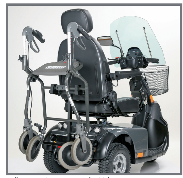
Rollator carrier, Max weight 20 kg