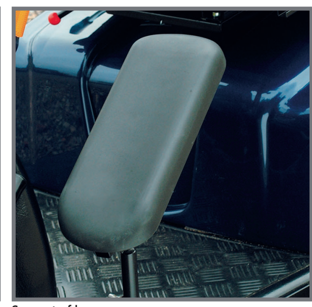
Support of legs