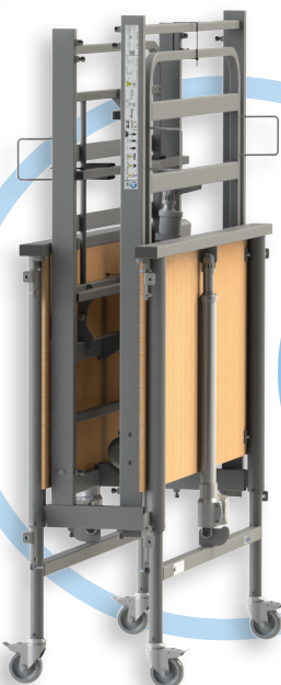
Casa Elite Community bed variant

The Casa Elite is supplied on a transport stand to assist with the transportation and storage of the bed.