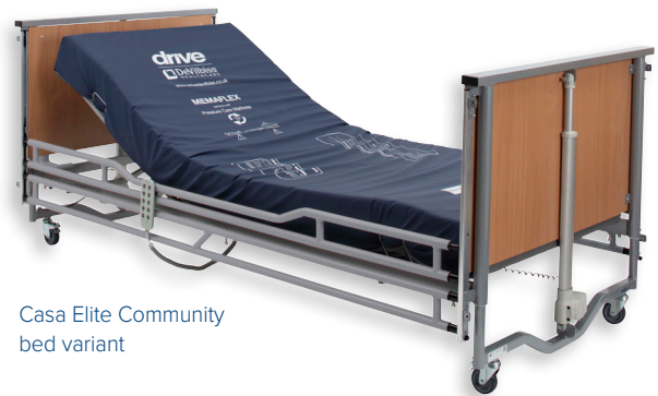
Casa Elite Community bed variant