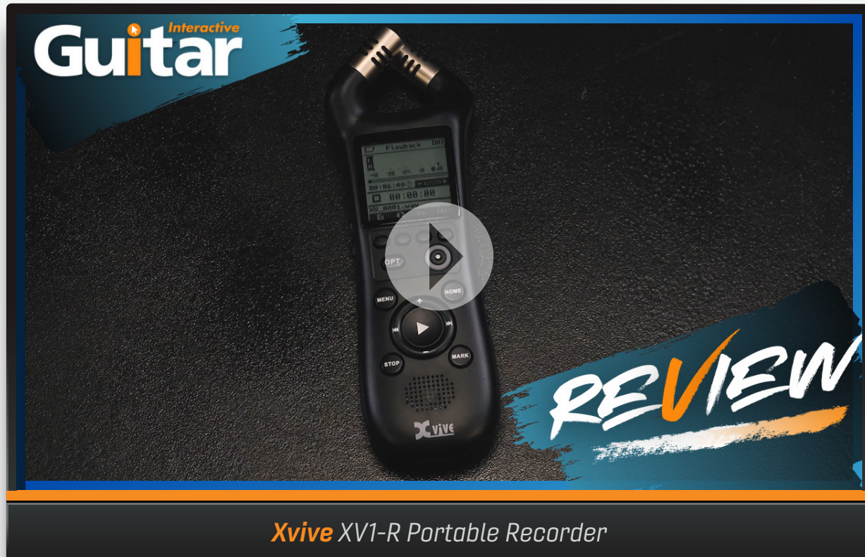
Xvive XV1-R Portable Recorder

The XV1-R is a handy little stereo field recorder that's perfect for recording rehearsals and gigs, making content for social media, demoing songs, recording audio for video... you name it. It features a stereo pair of ▶