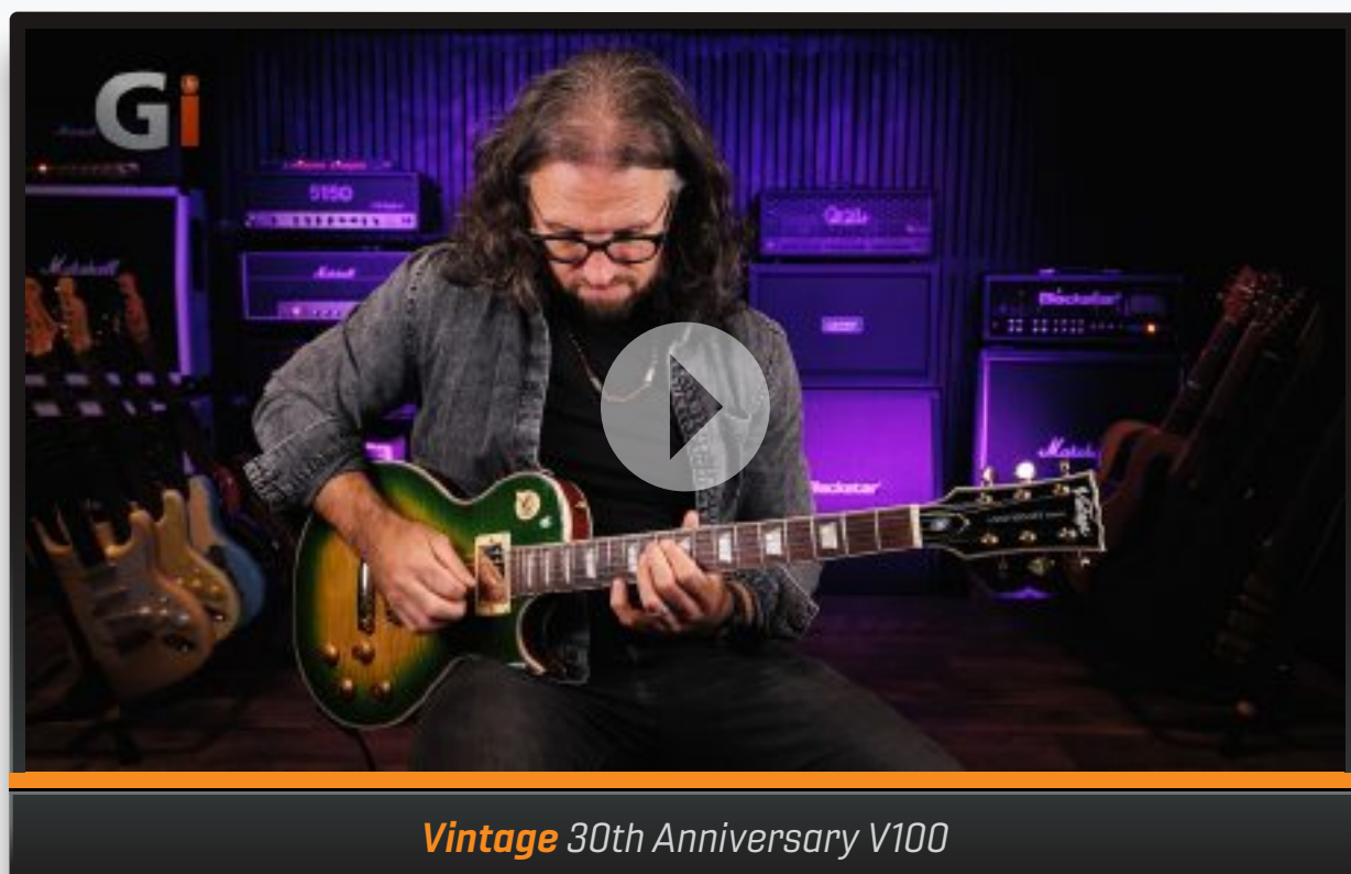
Vintage 30th Anniversary V100

Of course, if you're familiar with the Vintage story, the V100 Lemon Drop will need no introduction—a budget-friendly nod to the legendary "Greeny" that did more than just disrupt, it genuinely earned the respect of players who'd never previously looked ➔