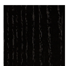
BLACK LACQUERED, FSC MIX 70%