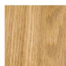
OAK LACQUERED, FSC MIX 70%