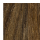
SMOKED OAK STAINED LACQ. FSC

Upholstery according to current price list.