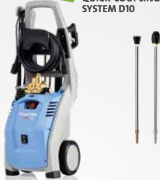
K 1050 T 49501