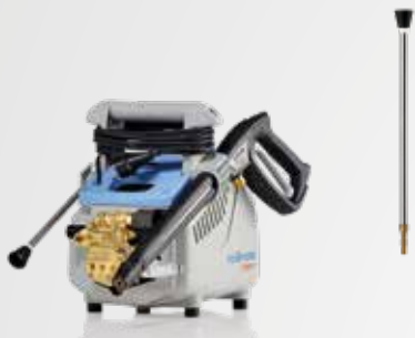
K 1050 P 49501