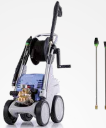
quadro 11/140 TST 40441