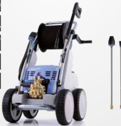
quadro 1200 TST 40422