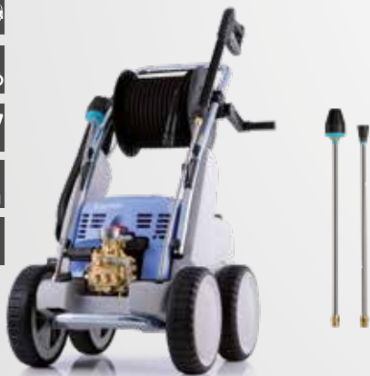
quadro 1000 TST 40421