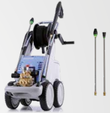
quadro 799 TST 40432