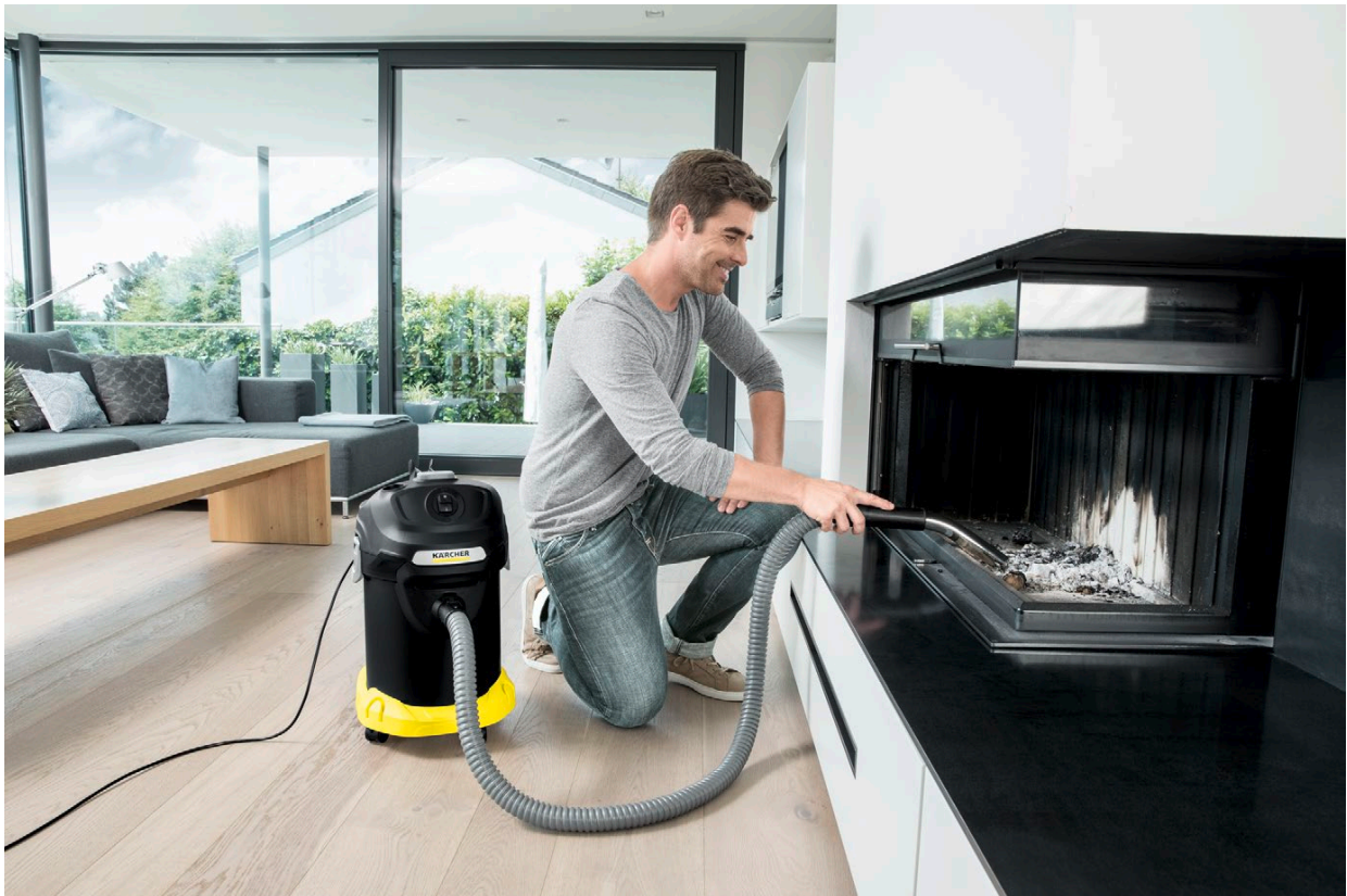
AD 4 Premium *GB