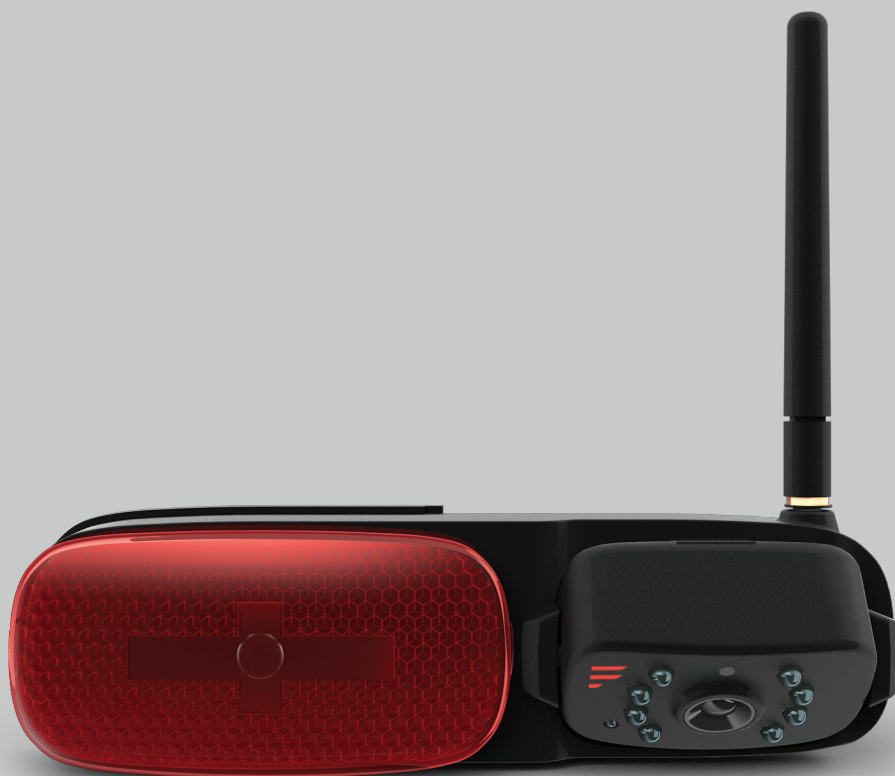
VISION S REAR CAMERA WITH MARKER LIGHT