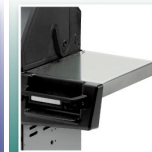
Stainless Steel Side Shelves