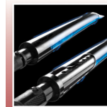
Stainless Steel Dual-Tube™ Burner System