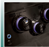
Built In Control Panel Lights