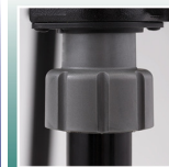
Independent Adjustable Feet