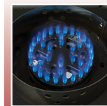
Windproof Burner Technology