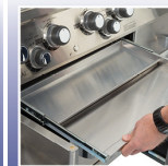
Slide-Out Grease Tray System