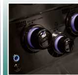
Built In Control Panel Lights