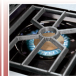
Commercial Grade Side Burner