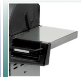
Stainless Steel Side Shelves