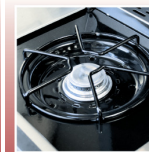
Powerful Side Burner