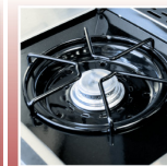
Powerful Side Burner