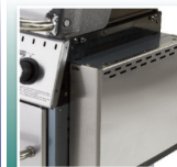
Drop Down Side Shelves