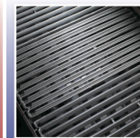
Heavy Duty Cast Iron Cooking Grids