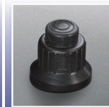
Sure-Lite™ Electronic Ignition System