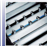
Stainless Steel Flav-R-Wave™ Cooking System