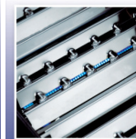
Stainless Steel Flav-R-Wave™ Cooking System