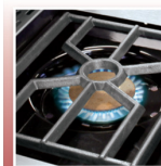
Commercial Grade Side Burner