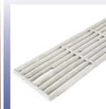
Heavy Duty Cast Stainless Steel Cooking Grids