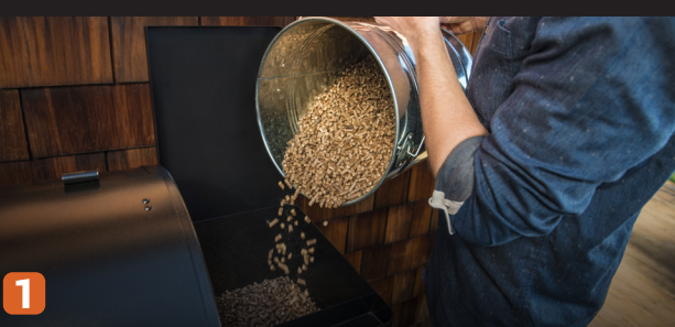
ALL NATURAL HARDWOOD PELLETS FUEL THE FIRE AND ADD INCREDIBLE FLAVOR.