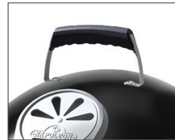
Sturdy Lid Handle