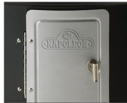
Easy Access Doors