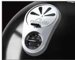
ACCU-PROBE™ Temperature Gauge