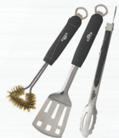
STAINLESS STEEL 3 PIECE TOOLSET #70024