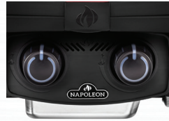
Ergonomic Control Knobs