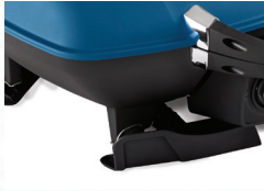
Folding Legs for Storage