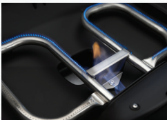
Dual Stainless Steel Burners for Direct or Indirect Grilling