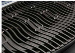
Porcelainized Cast Iron Iconic WAVE™ Cooking Grids