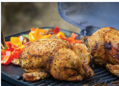
High-Top Lid for Versatile Grilling