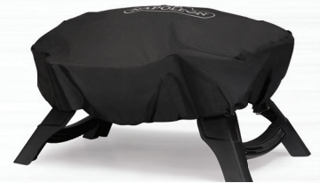
PREMIUM FITTED COVER #61286