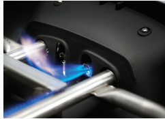
Instant JETFIRE™ Ignition