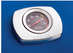
ACCU-PROBE™ Temperature Gauge