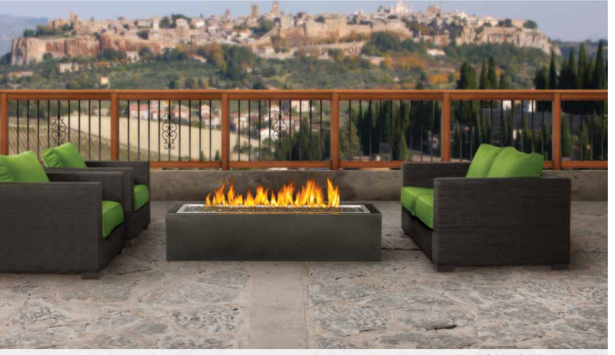
The Linear Patioflame ^{\circ} shown with standard Topaz CRYSTALINE ^{\circ} ember bed