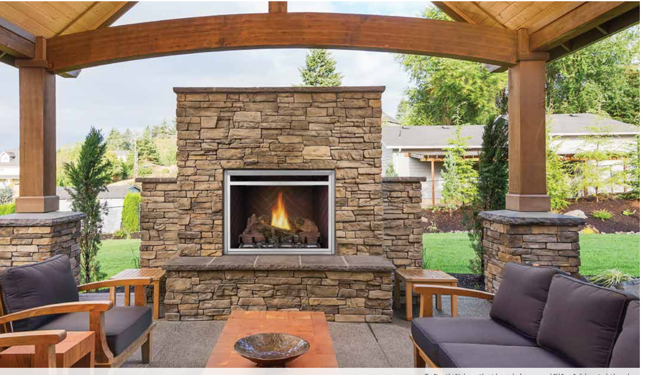
The Riverside 36 shown with stainless steel safety screen and Old Town Red decorative brick panels.