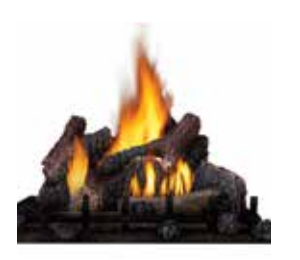
PHAZER° log set and embers (Included)