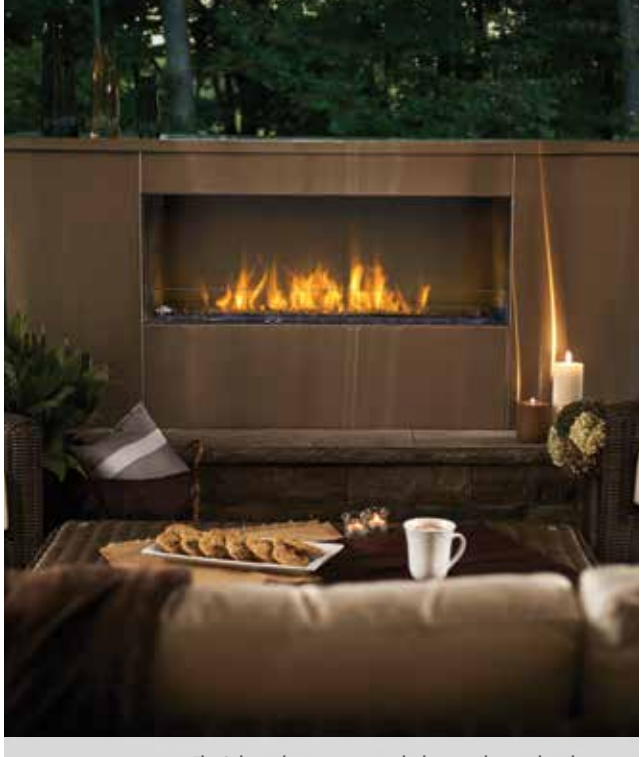
The Galaxy shown in a custom built-in stainless steel application

16 \frac{1}{2} "h x 47 \frac{1}{2} "w x 17 \frac{5}{16} "d 16 \frac{1}{2} "h x 47 \frac{1}{2} "w x 21 \frac{1}{6} "d Natural gas or propane Natural gas or propane