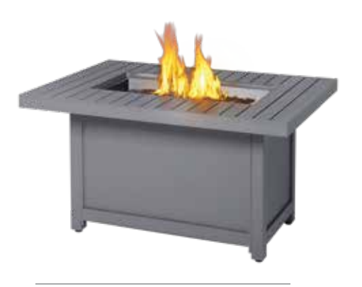
Rectangle - Grey