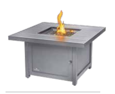
Square - Grey