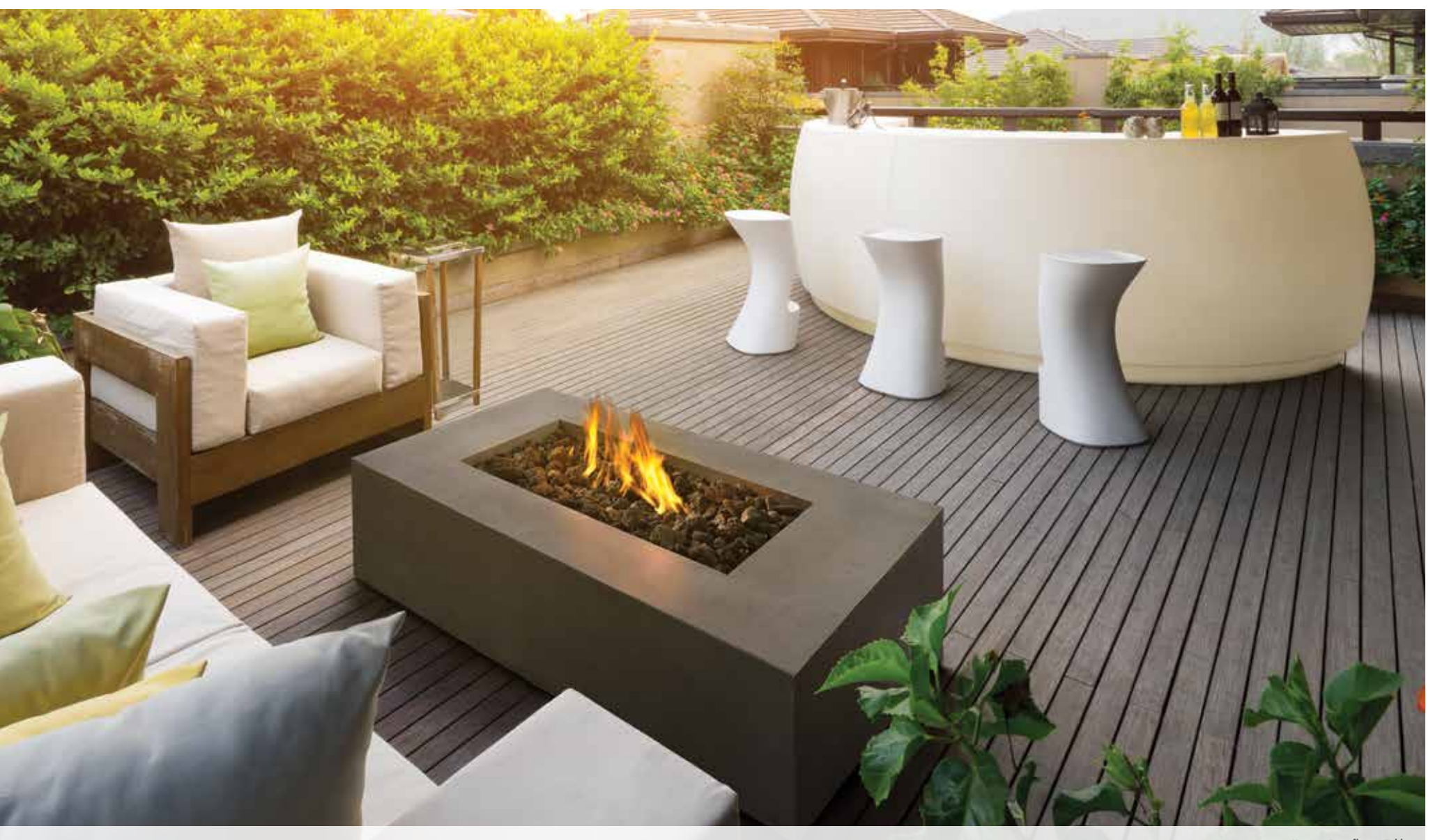
Uptown Patioflame® Table