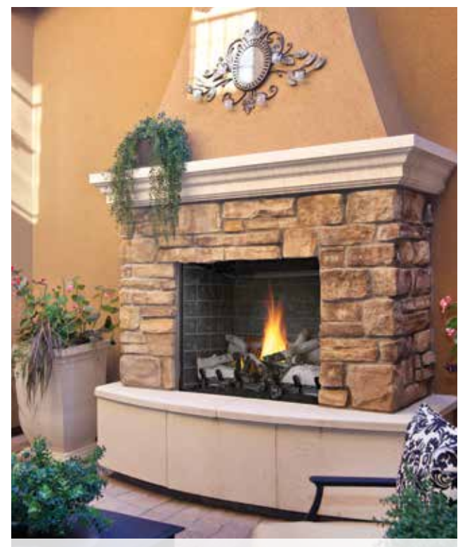
The Riverside 36 shown with Westminster Grey decorative brick panels.

Riverside" 36 Clean Face- GSS36CFNE Up to 40,000 BTU's Flame/heat adjustment 35 %6"h x 42"w x 20 %6"d Natural gas or propane