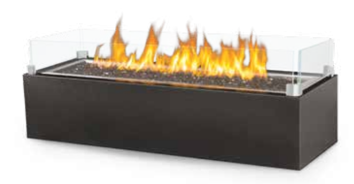
The Linear Patioflame" shown with standard Topaz CRYSTALINE" ember bed and windscreen

Linear Patioflame* - GPFL48MHP 60,000 BTU's 11 1/6"h x 51 1/6"w x 17 1/6"d Comes standard as Propane (Includes Natural Gas orifice)