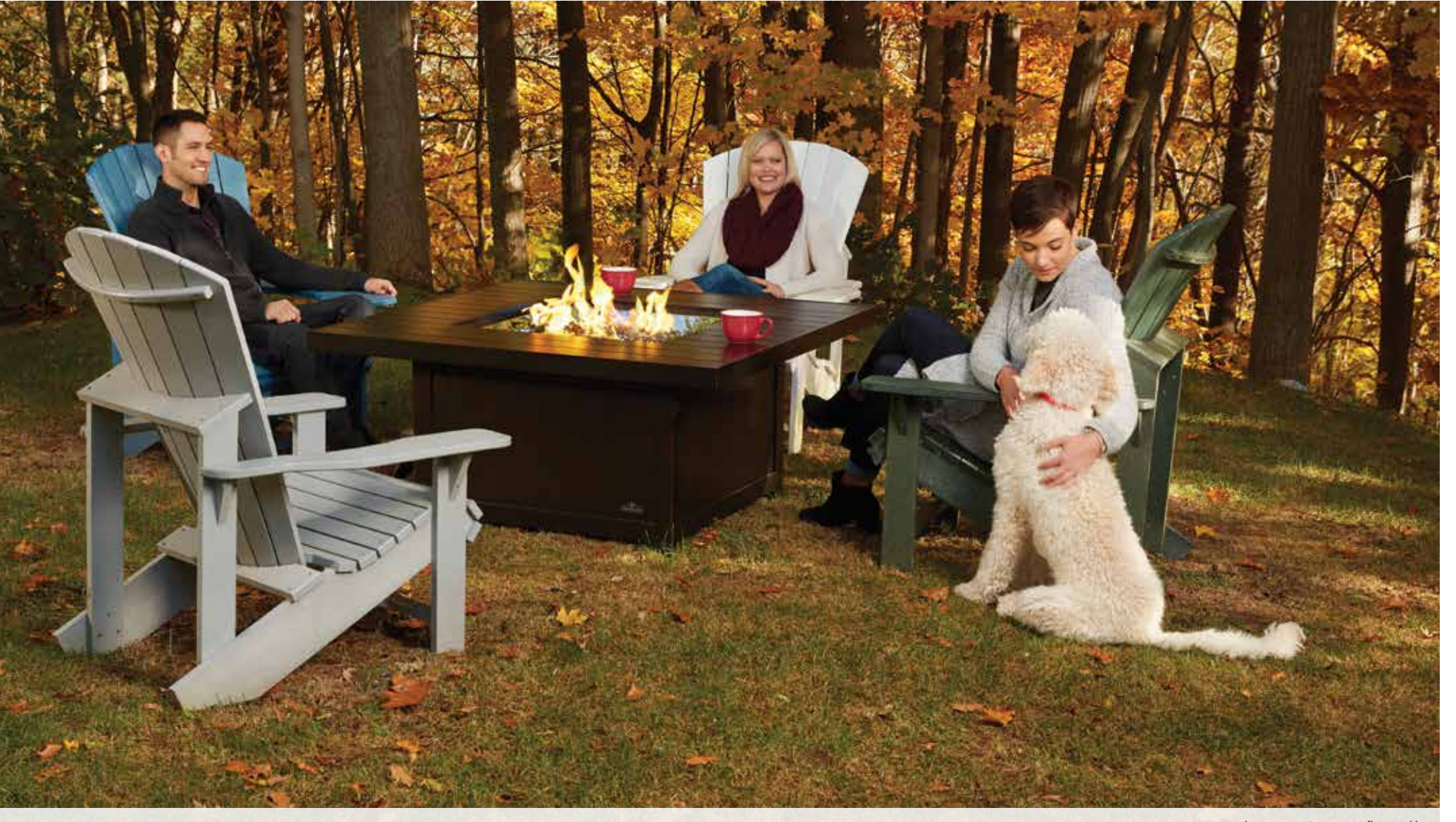
The St. Tropez Square Patioflame® Table