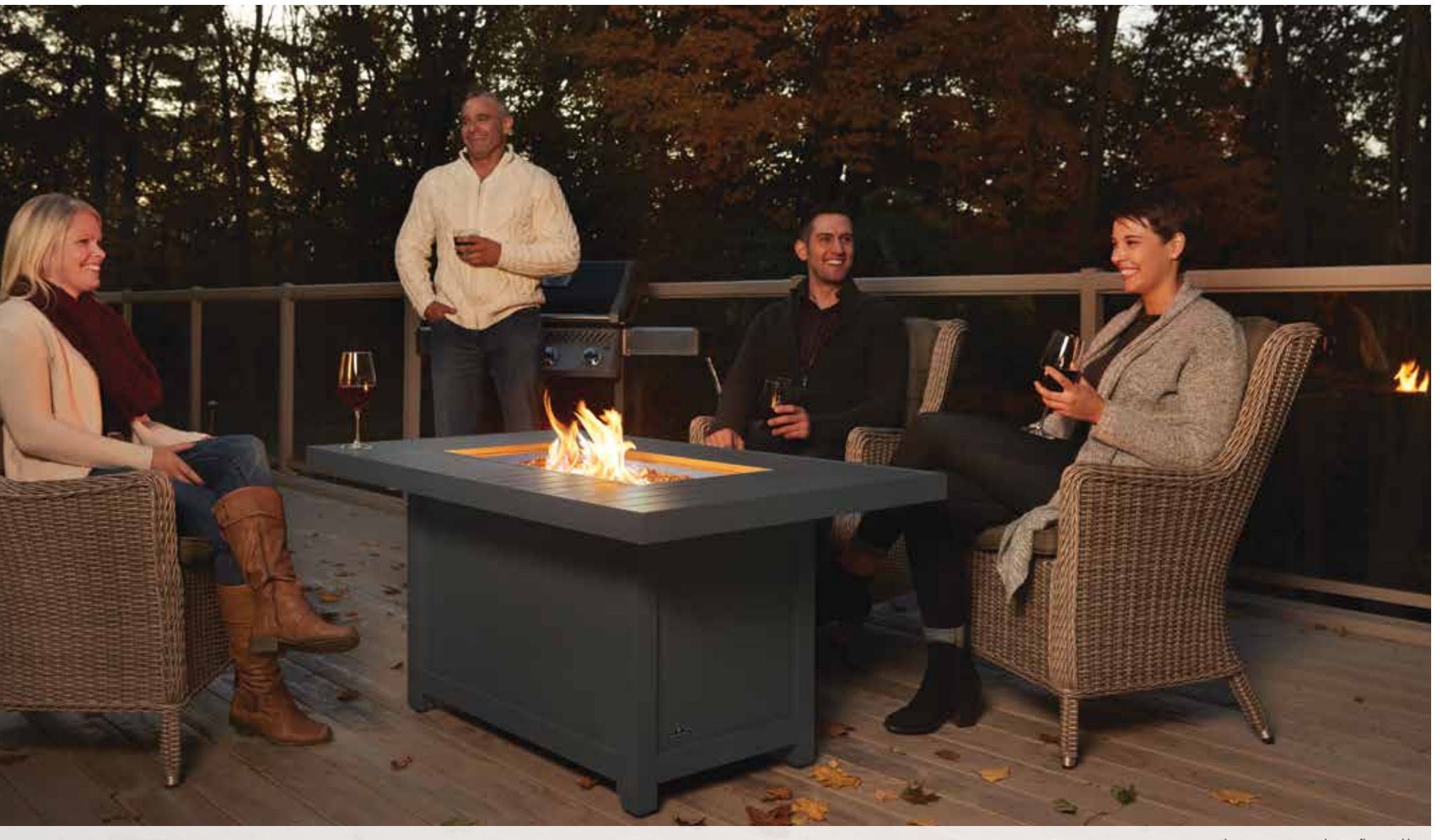
The Hamptons Rectangle Patioflame® Table