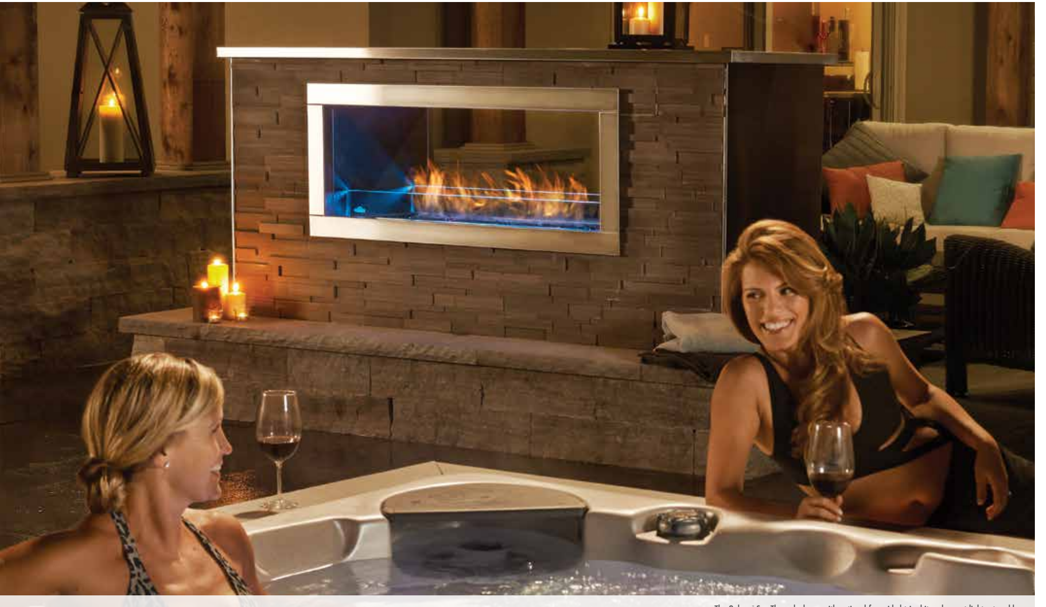
The Galaxy See Through shown with optional four-sided trim kit and accent light set on blue