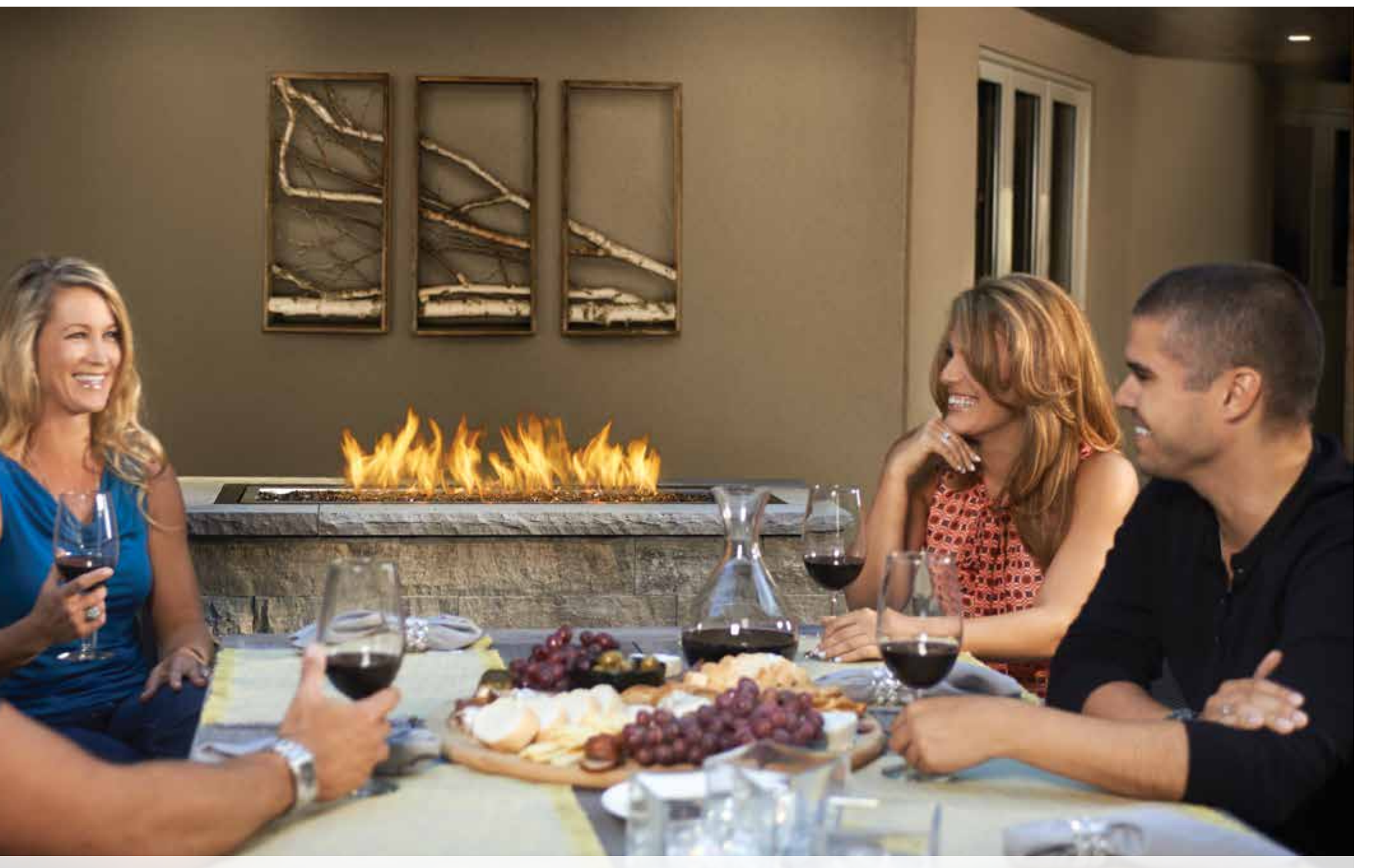
The Linear Burner Kit in a custom install application with Topaz ember bed