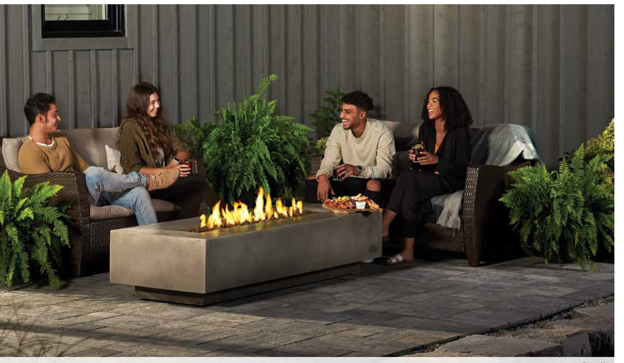
Nexus Patioflame® Table