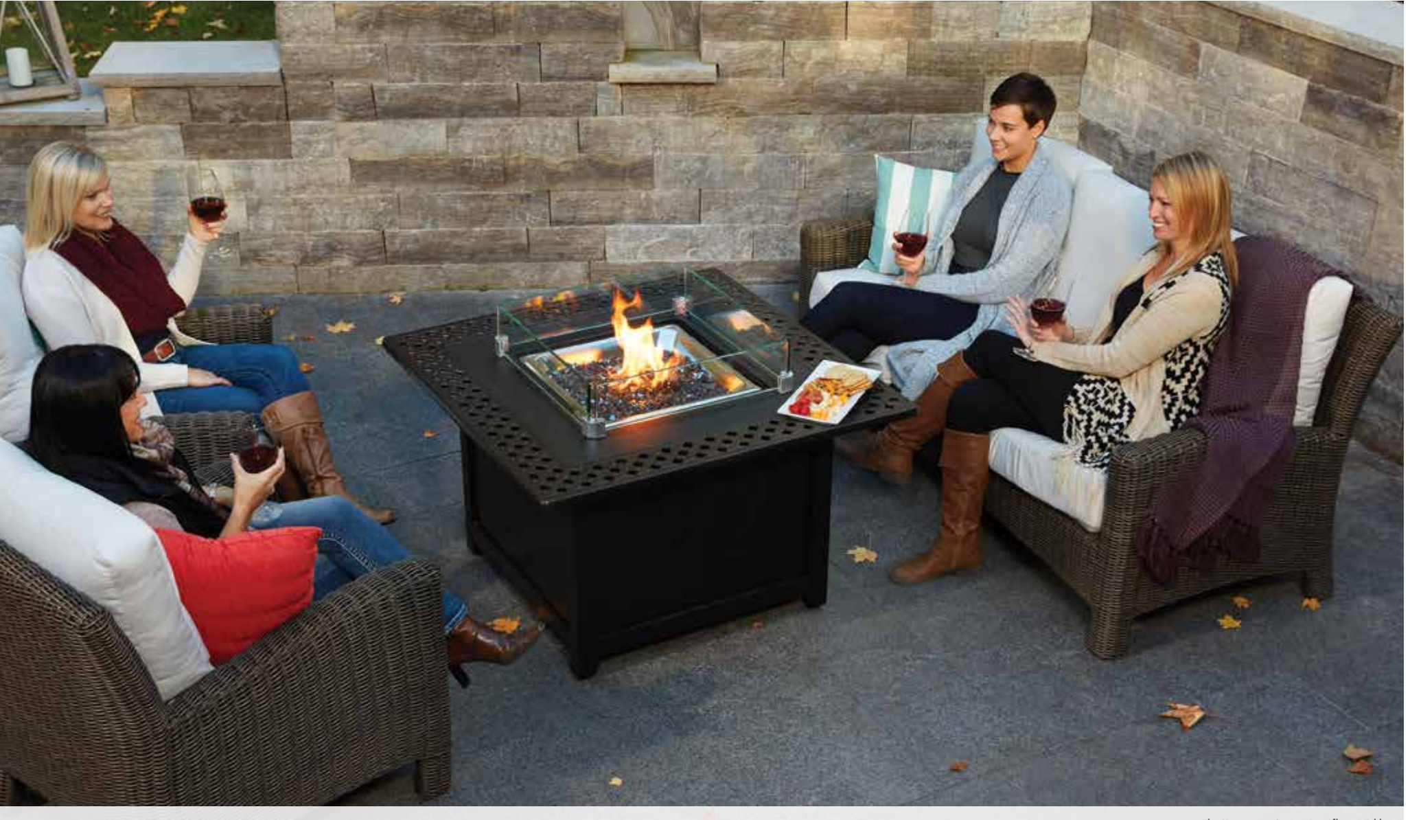
The Kensington Square Patioflame® Table