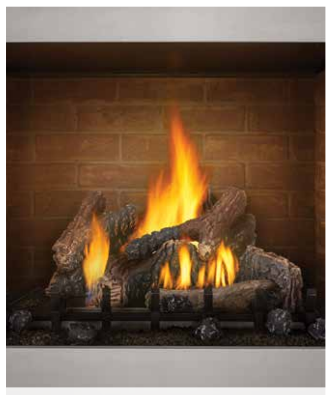
The Riverside 42 Clean Face shown with decorative sandstone brick panels