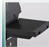
Stylish Steel Side Shelves