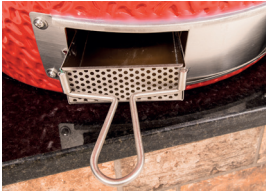
Patented Ash Collector