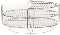
Divide & Conquer® System