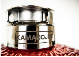
Kontrol Tower Top Vent