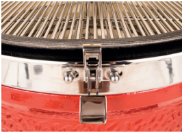
Stainless Steel Latch