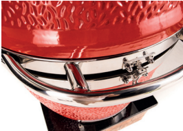
Stainless Steel Handle