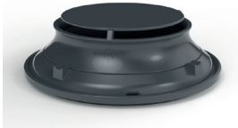
Patented Hyperbolic Insert