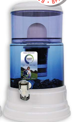
Glass Tank System

View our installation videos online zazen.com.au