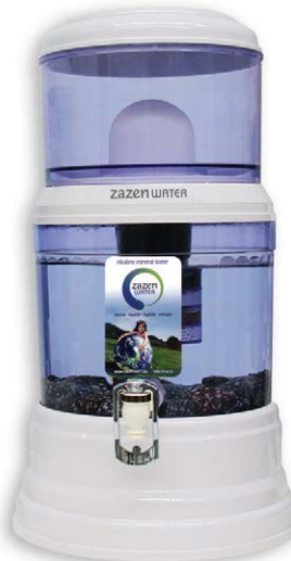
BPA Free System