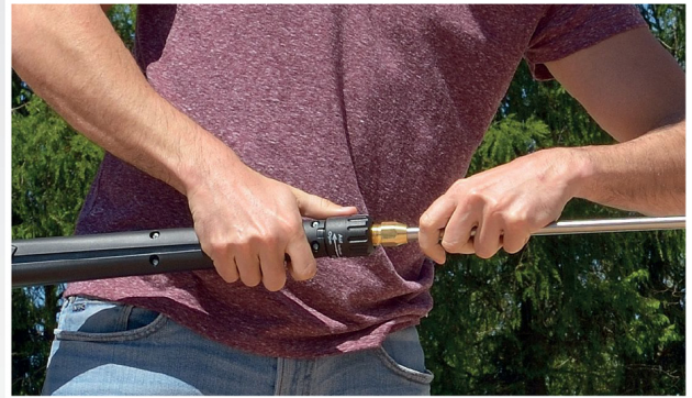
Fig. Version with threaded fittings