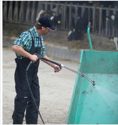
Fig. Double lance - with turning hand knob