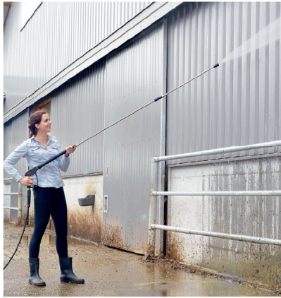
Fig. Lance extensions with stainless steel pipe