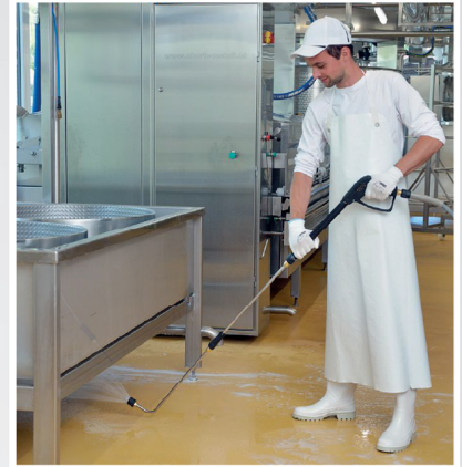
Fig. Hook lance with stainless steel pipe + Lance extensions with stainless steel pipe