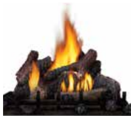
PHAZER® log set and embers (Included)