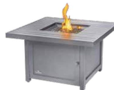
Square - Grey