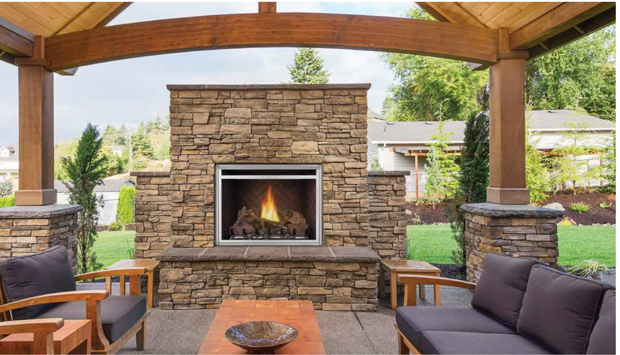
The Riverside™ 36 shown with stainless steel safety screen and Old Town Red® decorative brick panels.