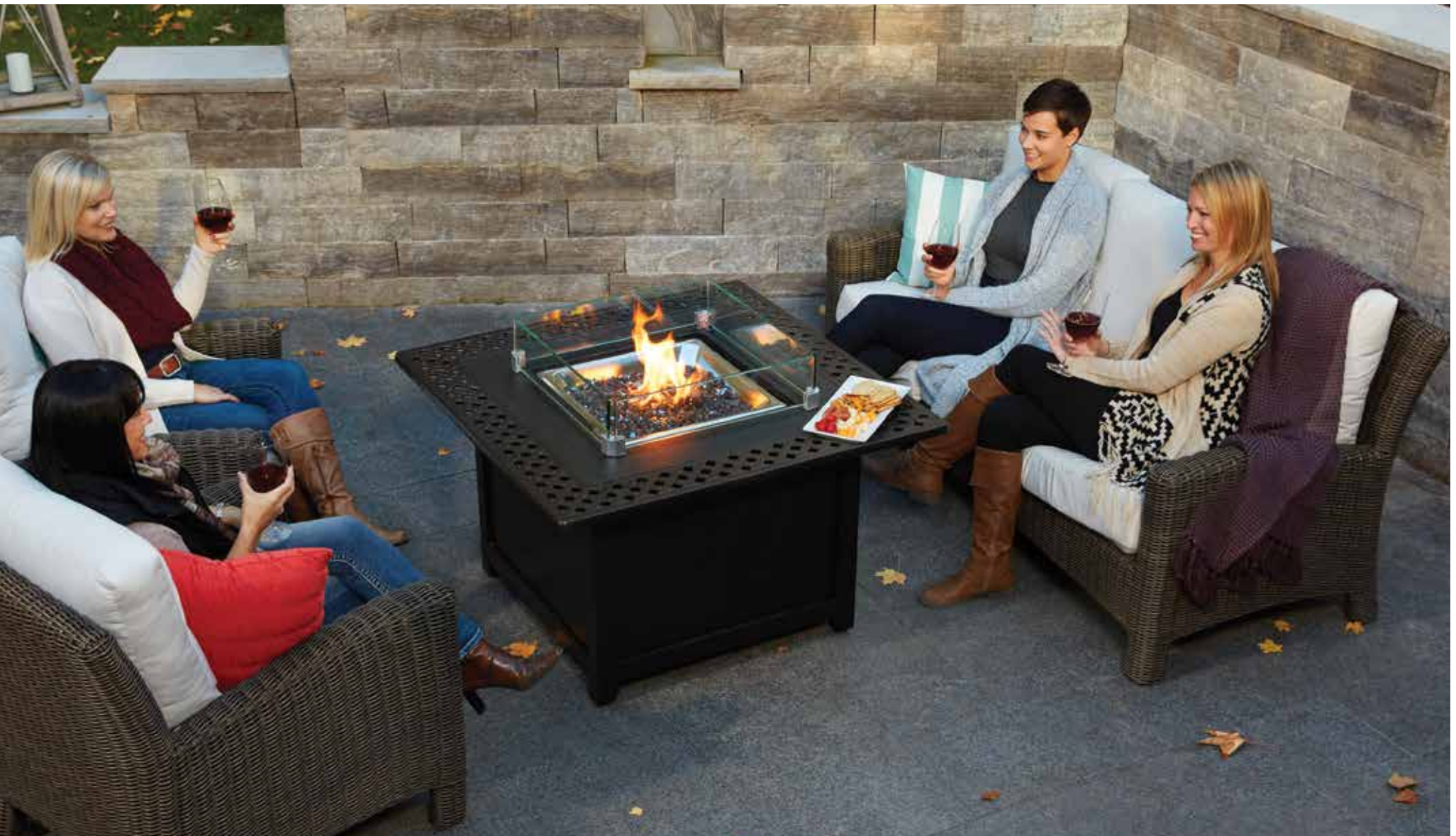
The Kensington Square Patioflame® Table