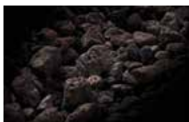
Smoky Black Lava Rock Media