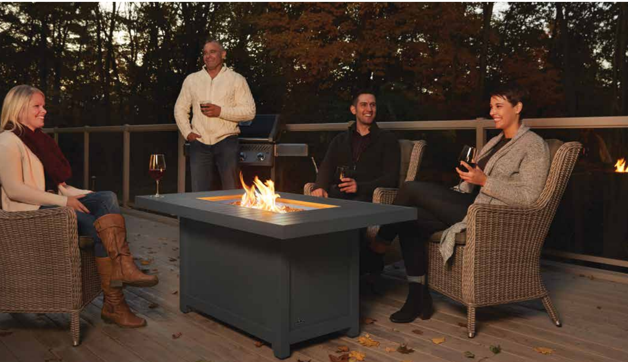
The Hamptons Rectangle Patioflame® Table