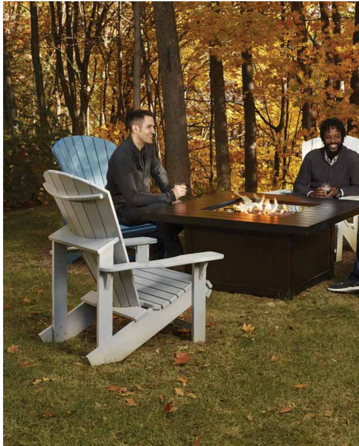
The St. Tropez Square Patioflame® Tables