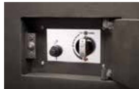
Flush Mount Control Panel