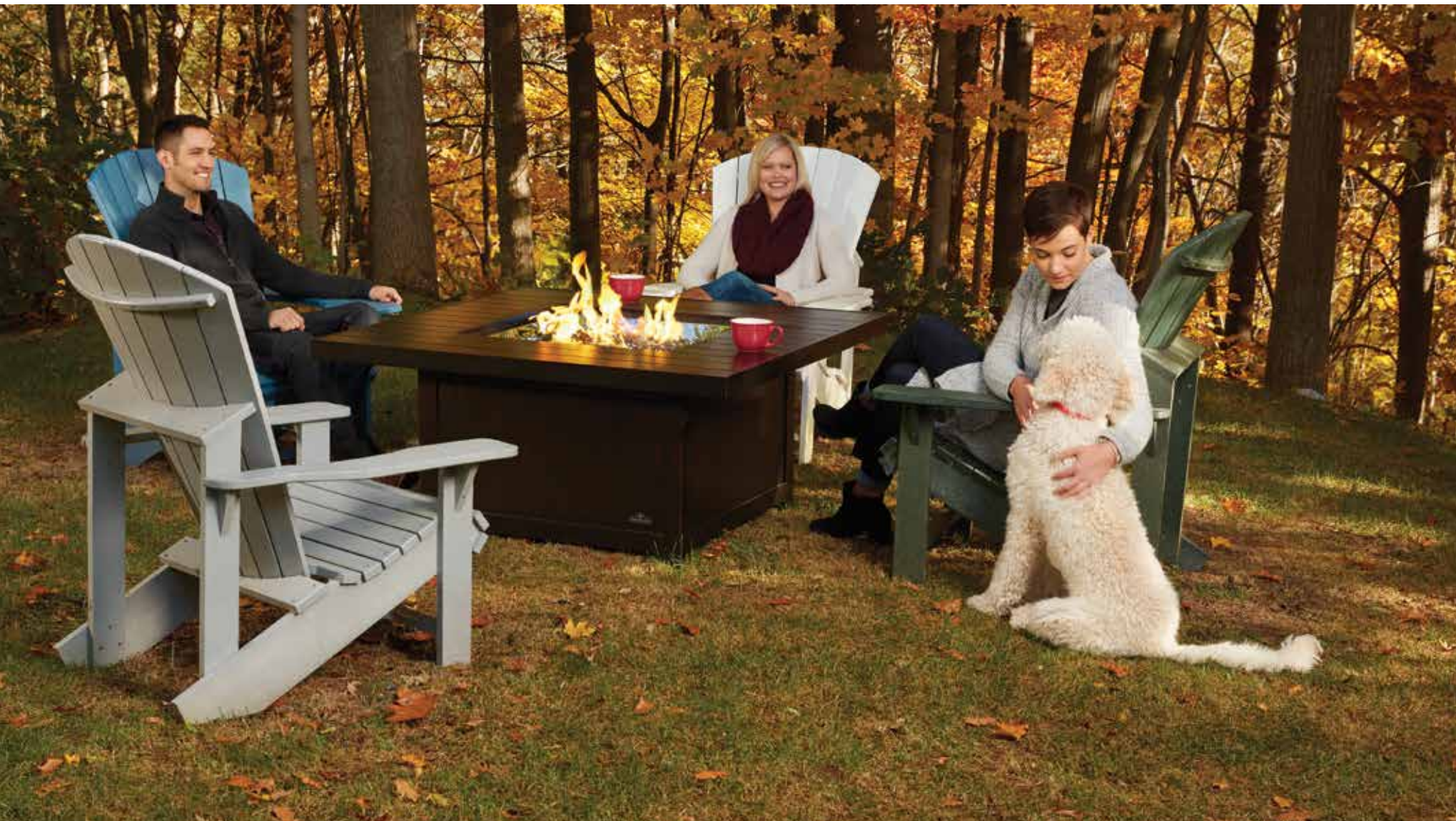
The St. Tropez Square Patioflame® Table