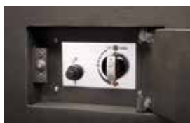
Flush Mount Control Panel