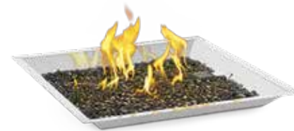
Square Burner Kit - GPFS60