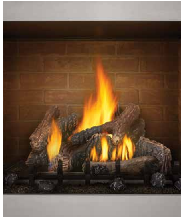
The Riverside™ 42 Clean Face shown with decorative sandstone brick panels