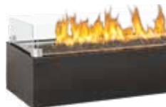
Glass Wind Deflector (optional)

* Cover is not for use with optional rock media kits.