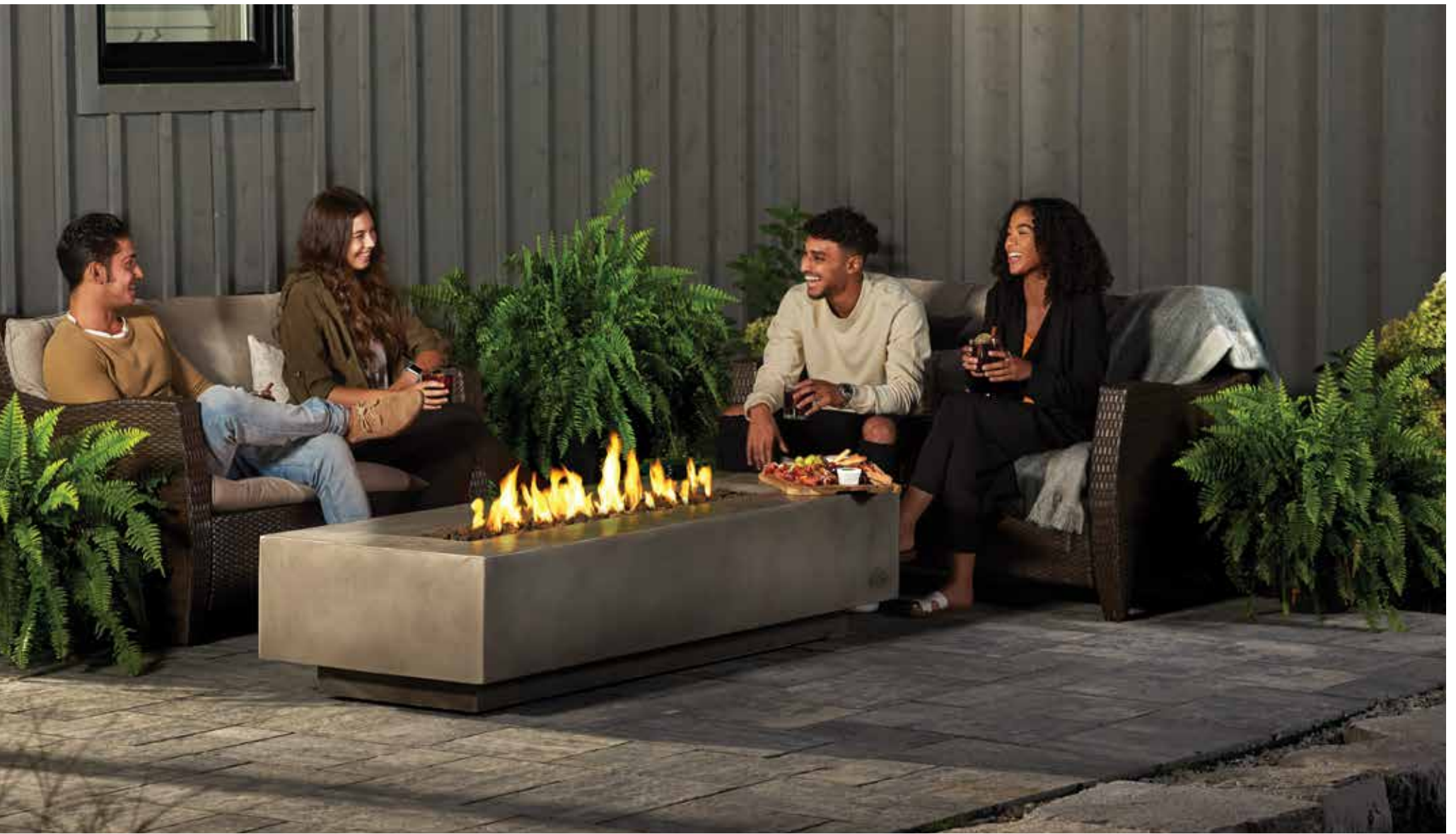
Nexus Patioflame® Table