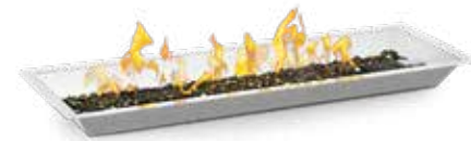
Rectangle Burner Kit - GPFR60