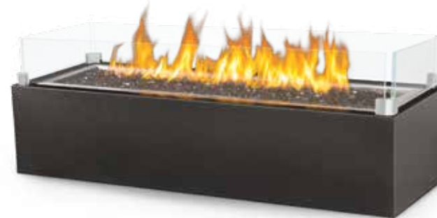
The Linear Patioflame® shown with standard Topaz CRYSTALINE™ ember bed and windscreen