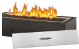
Brushed Stainless Steel Cover* and Hammertone Pewter Cabinet (included)