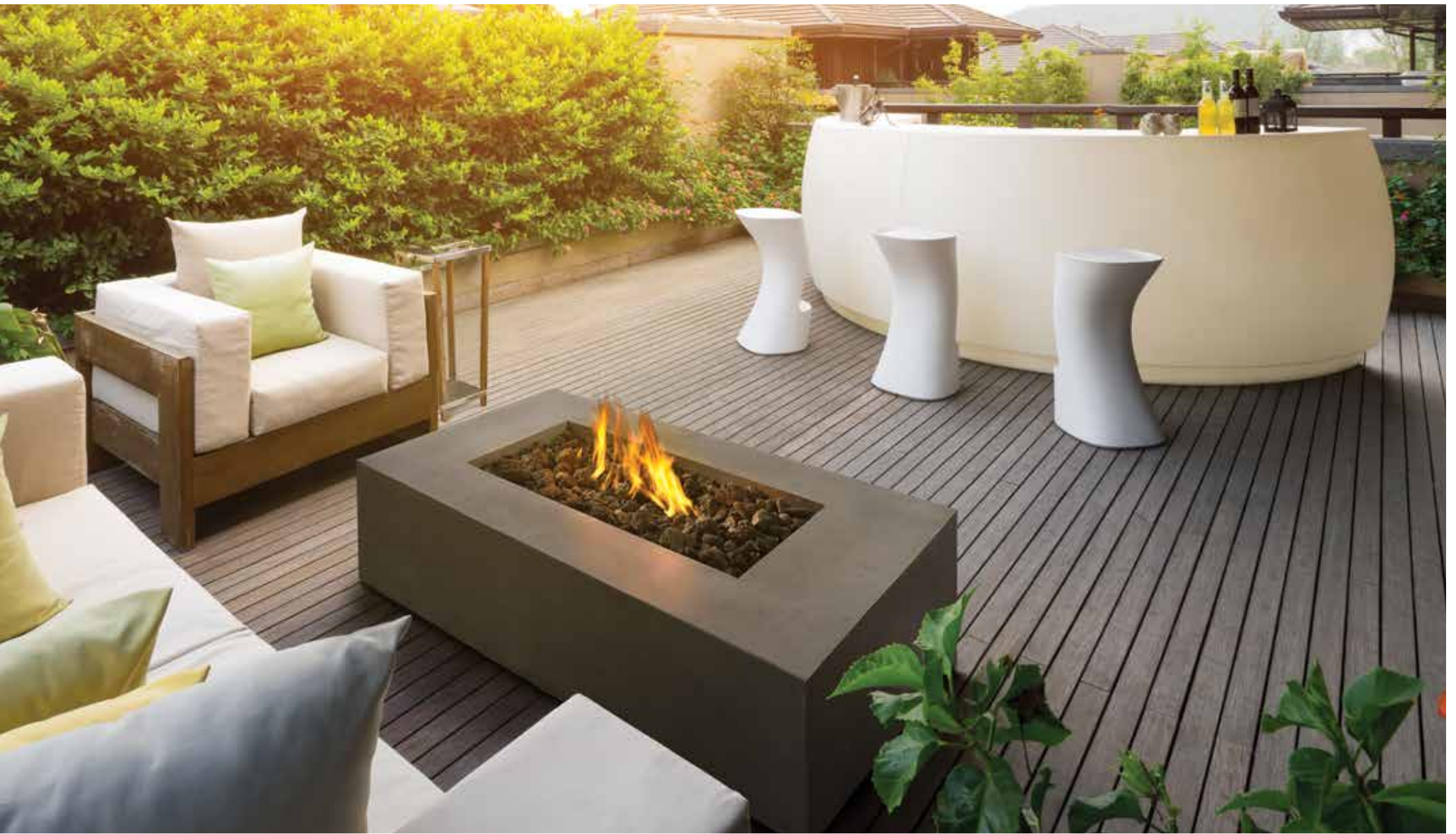
Uptown Patioflame® Table