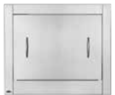
Stainless Steel Seasonal Cover (optional)