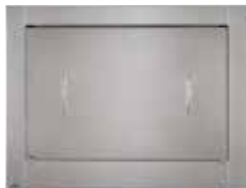
Seasonal Protective Cover (Optional)