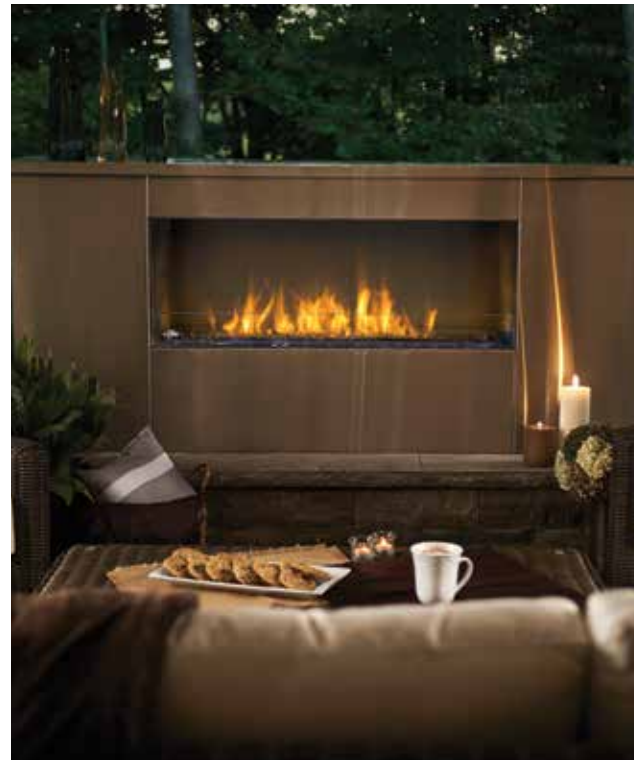
The Galaxy™ shown in a custom built-in stainless steel application