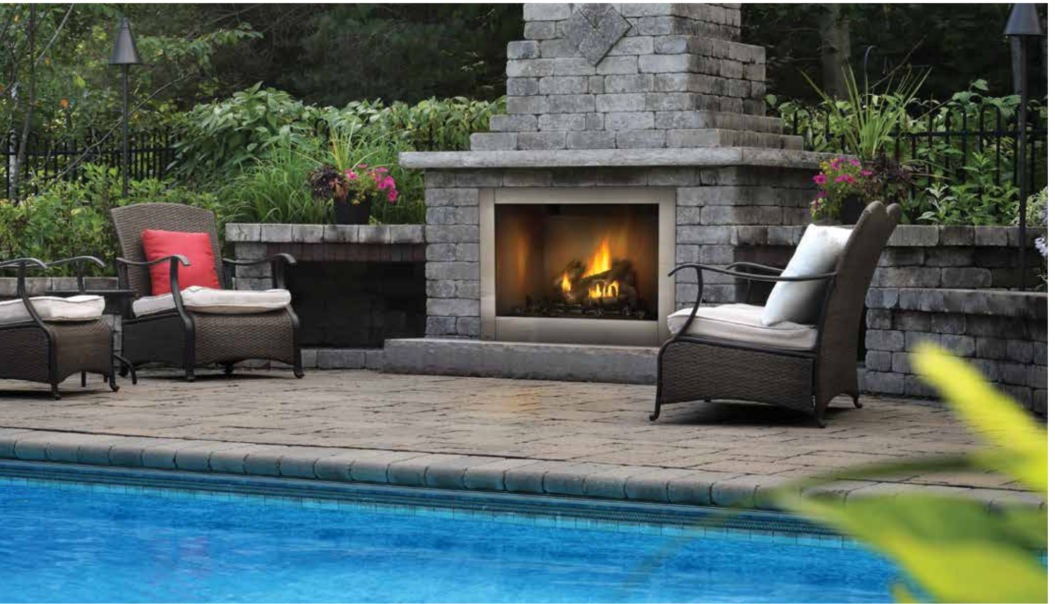
The Riverside™ 42 Clean Face