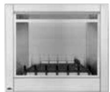
Stainless Steel Safety Screen (optional)