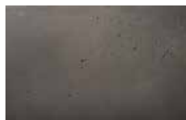
Textured Concrete-Look Finish