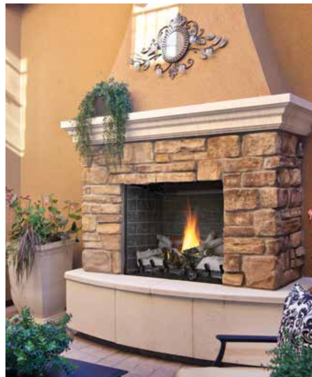
The Riverside™ 36 shown with Westminister Grey decorative brick panels.