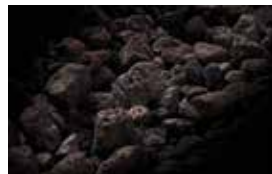
Smokey Black Lava Rock Media (Included)