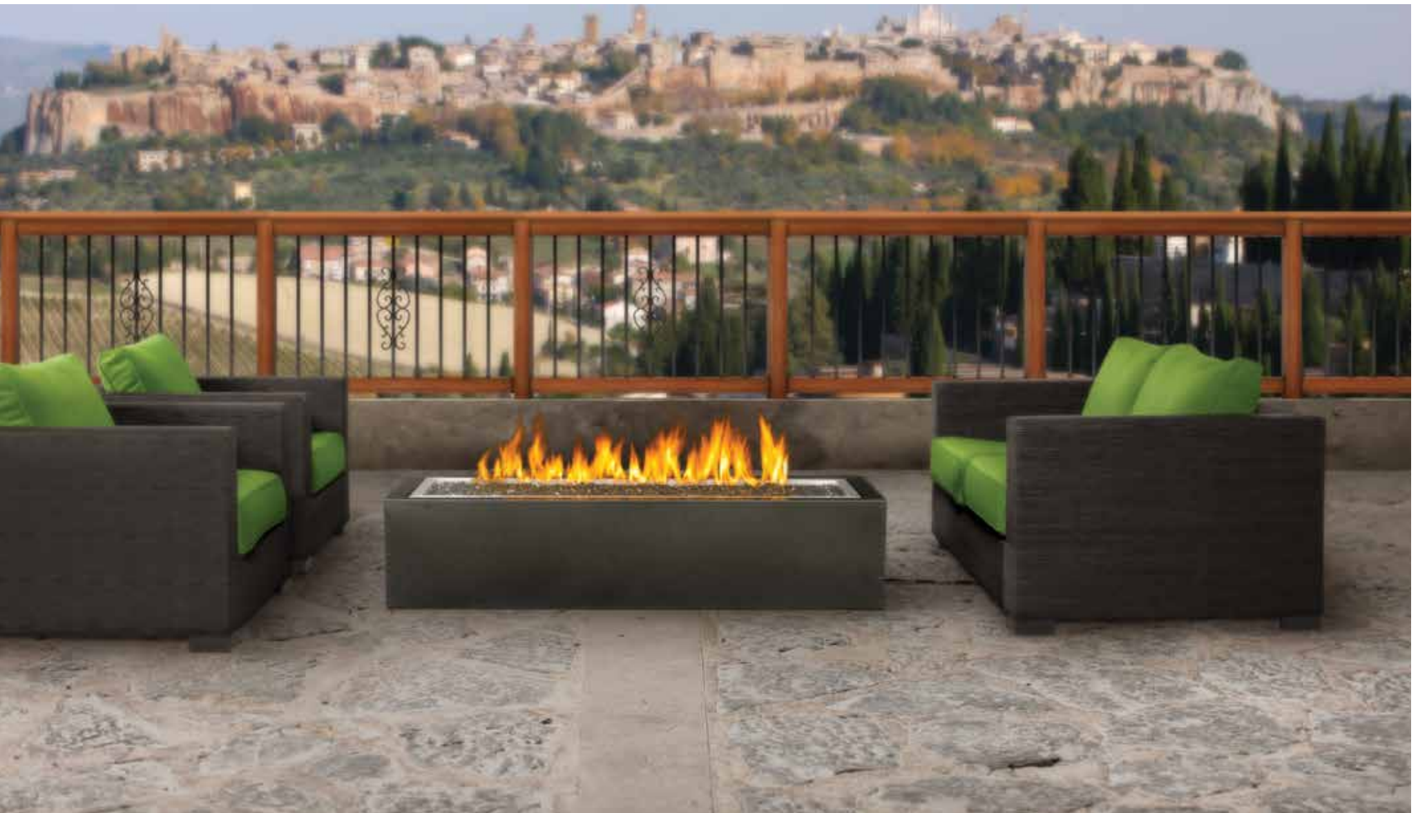
The Linear Patioflame® shown with standard Topaz CRYSTALINE® ember bed