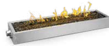
Linear Burner Kit - GPFL48

Consult your owner's manual for complete and up-to-date measurements and installation instructions for proper clearances to combustible materials.