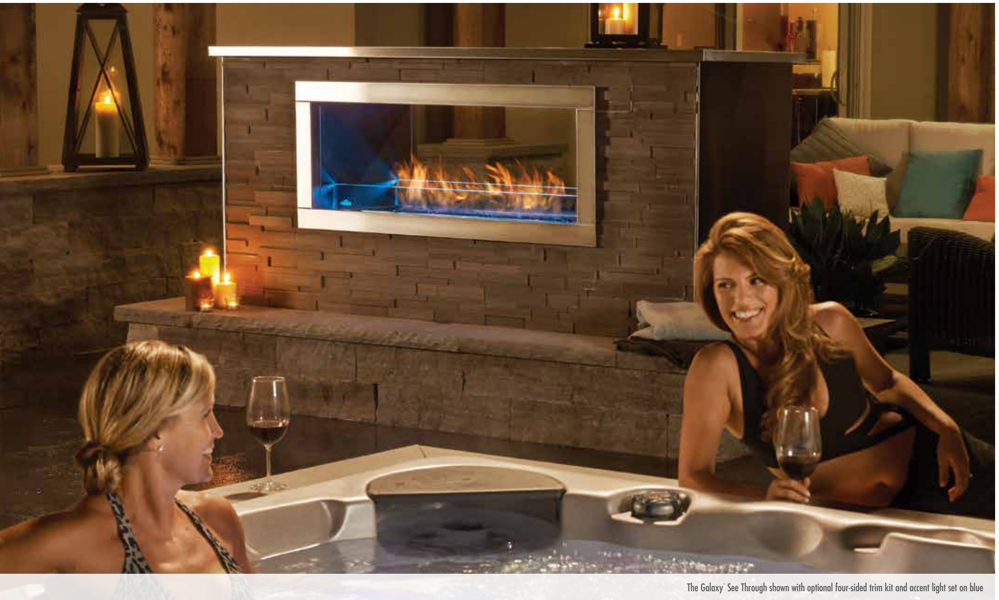
The Galaxy See Through shown with optional four-sided trim kit and accent light set on blue