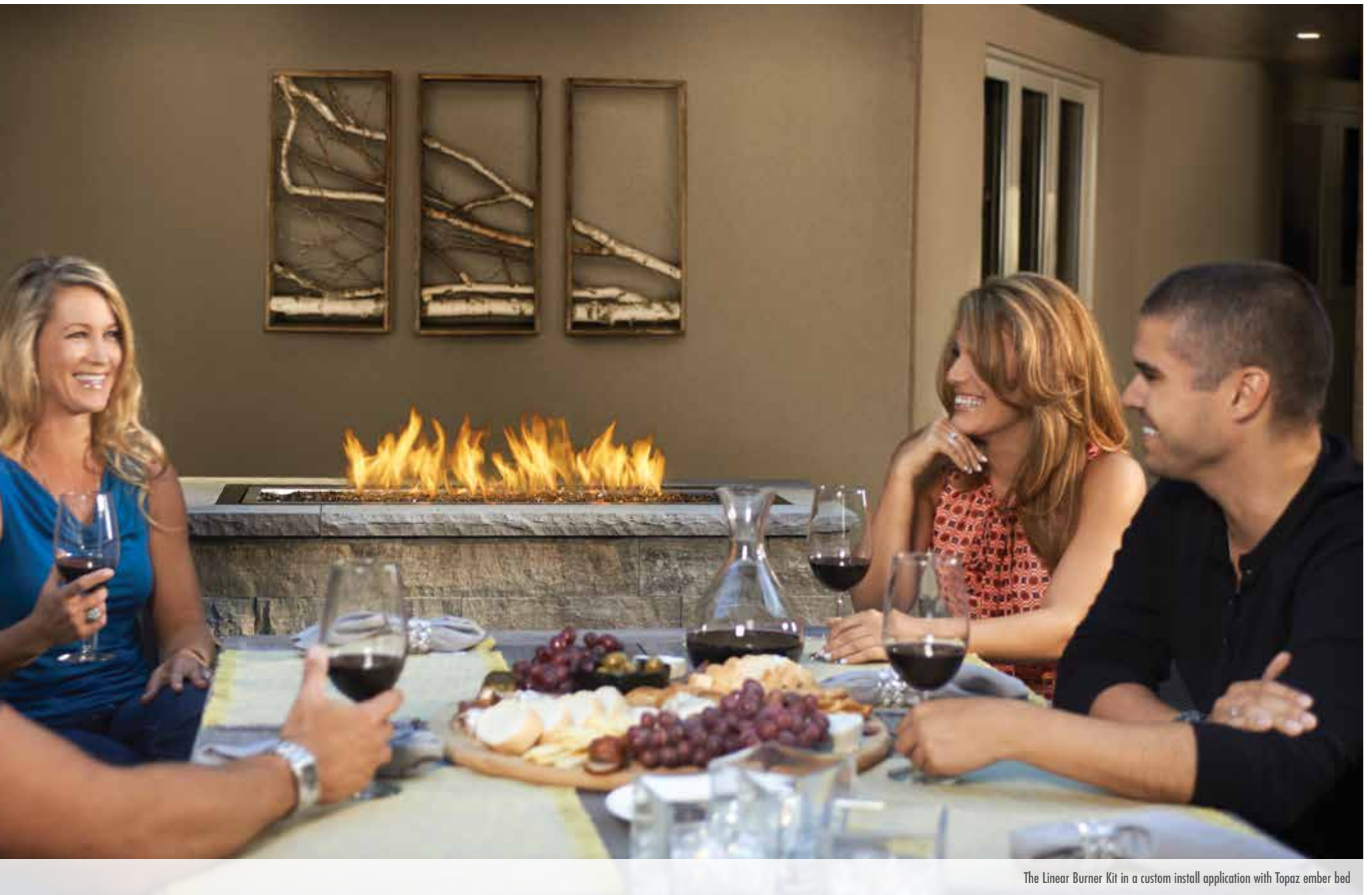
The Linear Burner Kit in a custom install application with Topaz ember bed