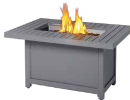
Rectangle - Grey