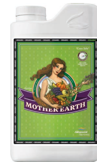
Mother Earth Super Tea Organic OIM