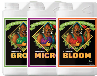
pH Perfect® Grow, Micro, Bloom