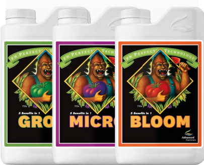
pH Perfect® Grow, Micro, Bloom