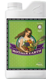
Mother Earth Super Tea Organic OIM