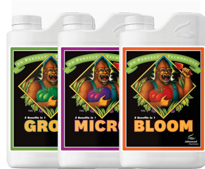
pH Perfect® Grow, Micro, Bloom