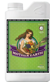
Mother Earth Super Tea Organic OIM