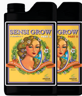
pH Perfect ® Sensi Grow A&B