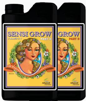
pH Perfect ® Sensi Grow A&B