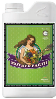
Mother Earth Super Tea Organic OIM