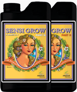
pH Perfect® Sensi Grow A&B