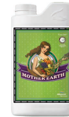
Mother Earth Super Tea Organic OIM