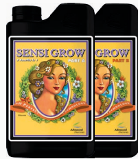
pH Perfect® Sensi Grow A&B