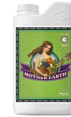
Mother Earth Super Tea Organic OIM