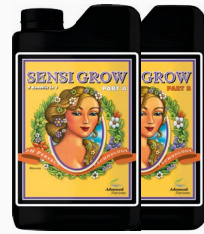
pH Perfect® Sensi Grow A & B